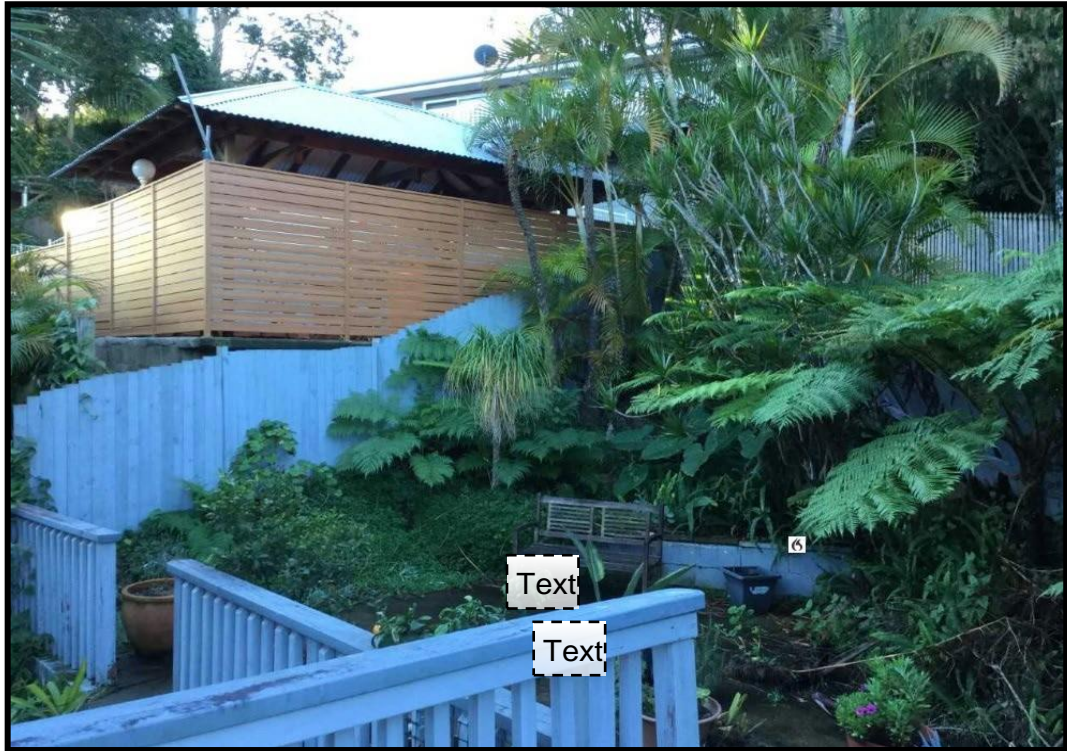
VIEW FROM REAR DECK TOWARDS REAR PROPERTY