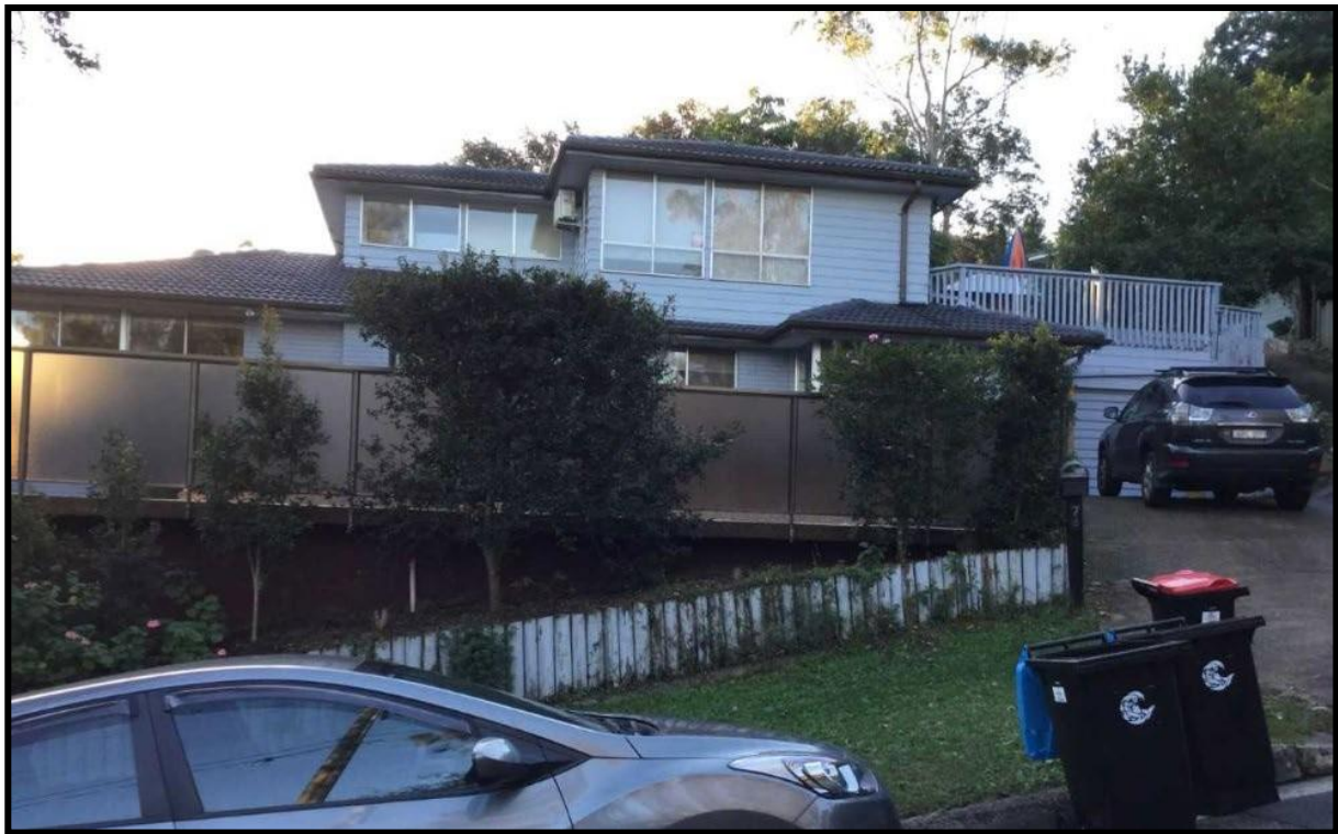
SUBJECT SITE SHOWING REAR DECK OVER GARAGE TO BE ROOFED OVER.