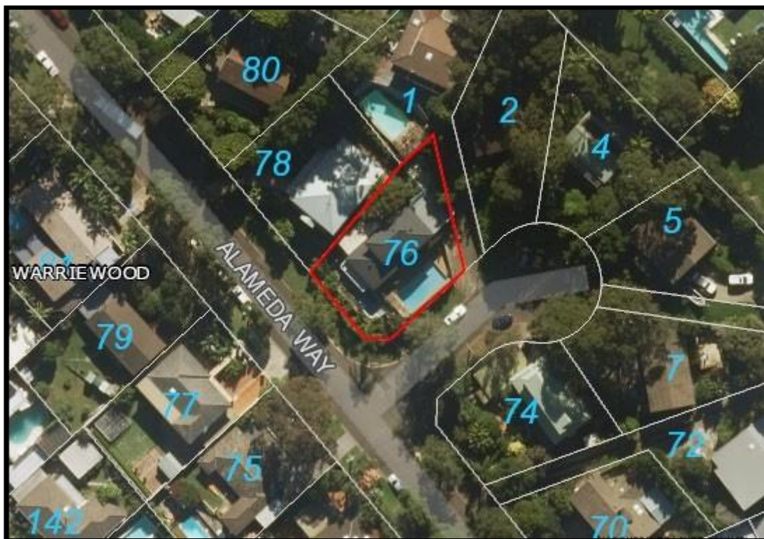
SUBJECT SITE HIGHLIGHTED

The subject site slopes from the rear north-western corner to a low point on the splay corner at the junction of the two streets.