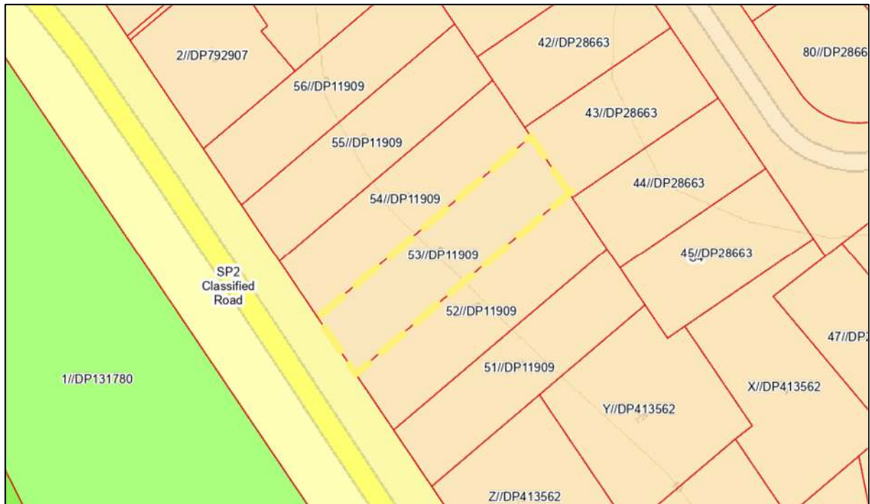
Figure 1: The existing site plan of the Subject Site.

The site located at 728 Barrenjoey Road, Avalon Beach, is situated within the Northern Beaches region of Sydney, known for its coastal charm and residential appeal. Avalon Beach is a suburb celebrated for its beachside lifestyle, scenic views, and a strong sense of community.