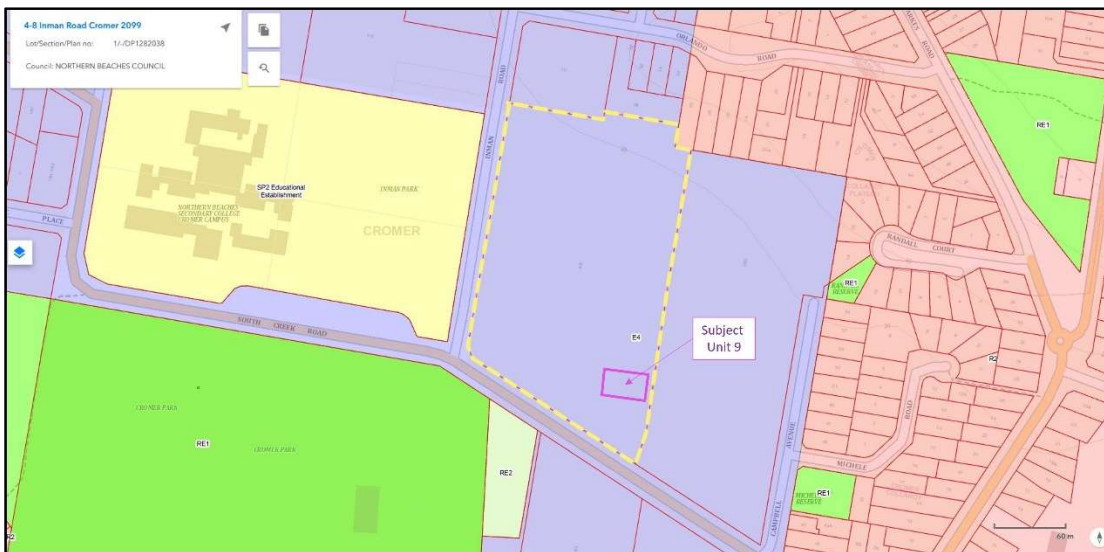
Locality Map – NSW ePlanning Portal Spatial Viewer – Accessed October 2023 - Superimposed

The site address relates to the existing “Warehouse” tenancy known as Unit 9 of 4-8 Inman Road, Cromer, NSW, 2099 which is registered on Lot 1/-/DP1282038. The subject property is situated on the North Eastern corner of the Inman and South Creek Roads intersection with primary vehicle access provided via South Creek Road. The subject tenancy consists of a Gross Floor Area (GFA) of 1,141m 2 (including an existing mezzanine floor area of 141m 2 ) and is situated among “Indoor Recreation Facilities”, “Offices” and “General Industrial Warehouses” on the site. The subject property is further positioned within an E4 – General Industrial land use zone pursuant to the Warringah Local Environmental Plan (LEP) 2011. Land uses within the greater surrounds include Cromer Park to the South, Northern Beaches Secondary College to the West, Commercial uses to the North and Medium Density Residential to the East.