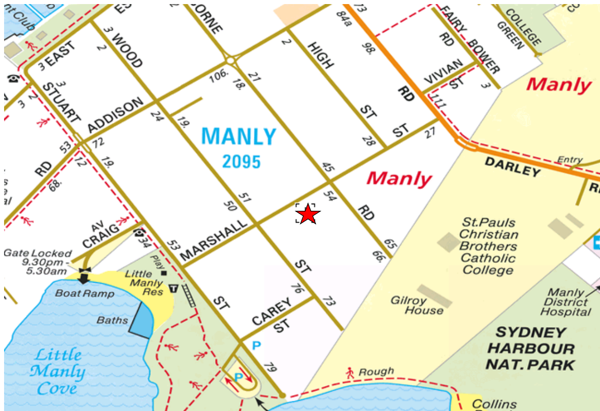
Site Location Map

The site is identified as Lot B in DP 344759 which is known as No. 19 Marshall Street, Manly. The site is located on the southern side of Marshall Street with a street frontage 11.28m. The site is rectangular in shape and has an area of 533.2m 2 with a depth of 47.335m. The locality is depicted in the following map: