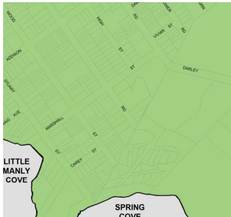
Extract of Terrestrial Map

The site is mapped on Council's Terrestrial Biodiversity Map. The proposal does not provide any major earthworks. The proposal is for a change of use, retractable awning over existing footprint and a small access stair. The works do not require removal of any vegetation and no further information is required in this regard.