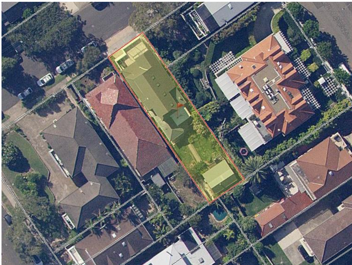
Aerial Photograph of Locality

The existing surrounding development comprises a mix of single detached dwellings, semi attached dwellings and multi dwelling housing comprising of 1, 2 and three storeys. The existing surrounding development is depicted in the following aerial photograph: