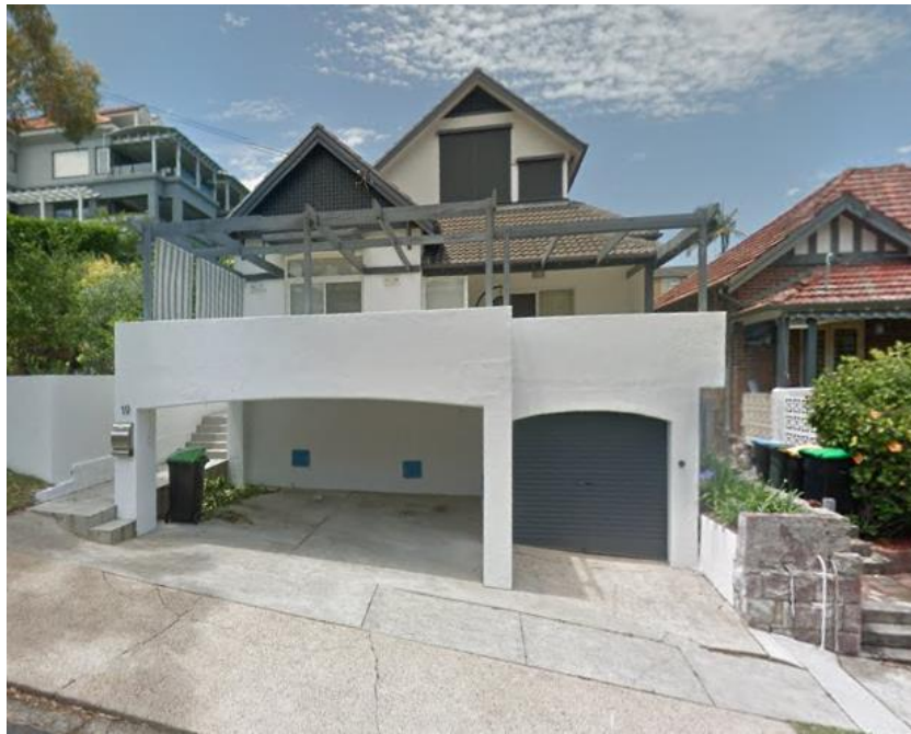
View of Subject Site from Street

The existing surrounding development comprises a mix of single detached dwellings, semi attached dwellings and multi dwelling housing comprising of 1, 2 and three storeys. The existing surrounding development is depicted in the following aerial photograph: