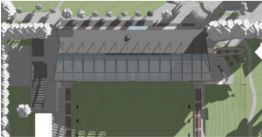
PROPOSED SHADOWS - JUNE 22nd - SOLAR 0900