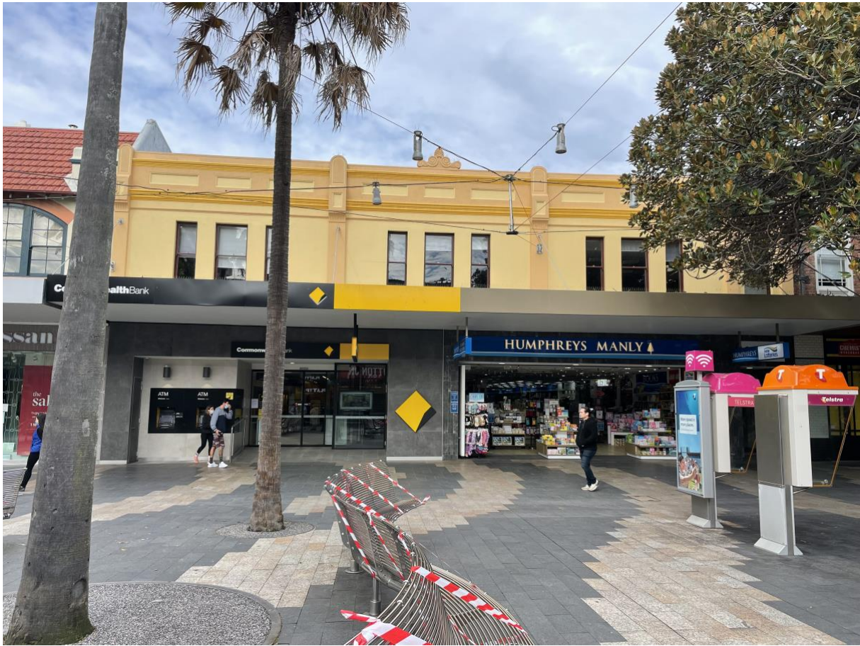
Figure 2: View of the site 60-64 The Corso, Manly