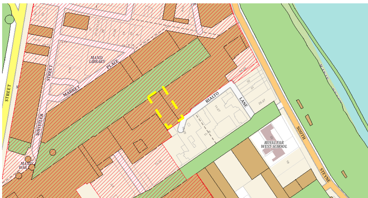
Figure 5: Extract of Manly Heritage Map. Location of the subject site marked in yellow

The subject site is classified as a heritage item described as a 'group of commercial buildings' (item no. I106), 'group of commercial buildings' (item no. I109), and is located within the Town Centre Heritage Conservation Area (Conservation area: C2).