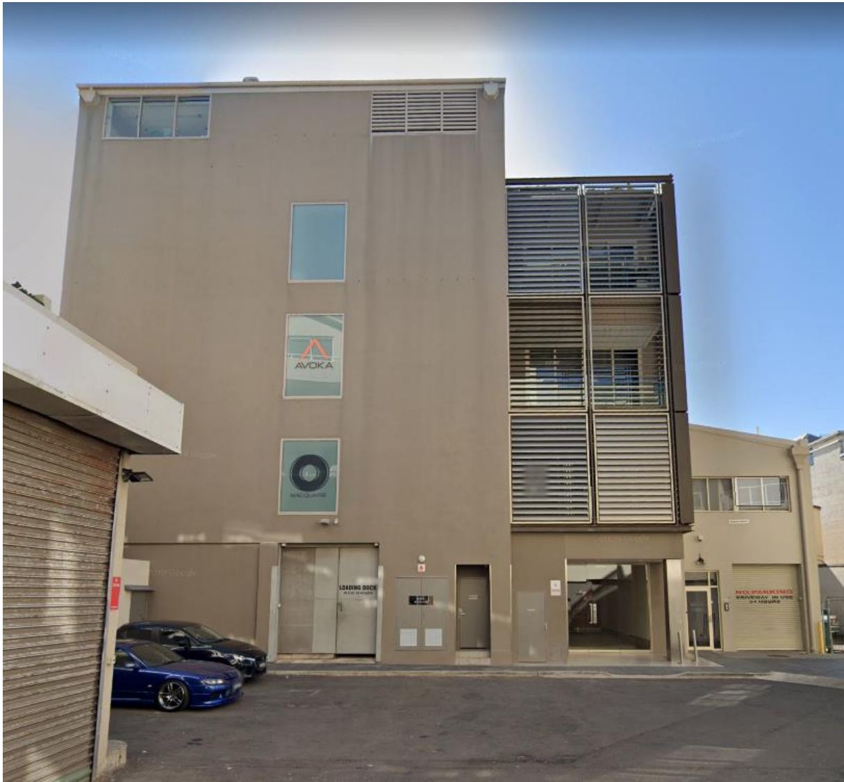
Figure 3: View of the site from Rialto Lane, Manly