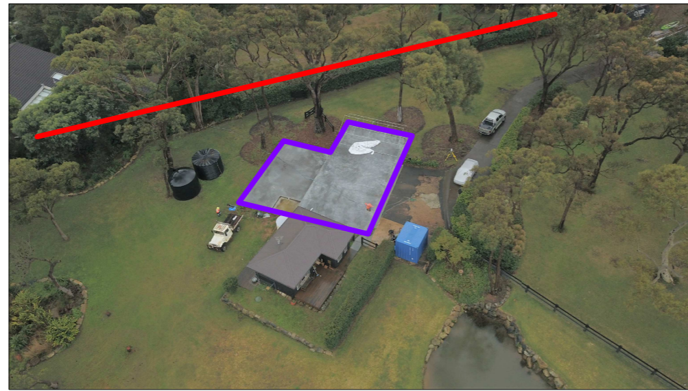
NEW CONCRETE SLAB LOOKING NORTH EAST