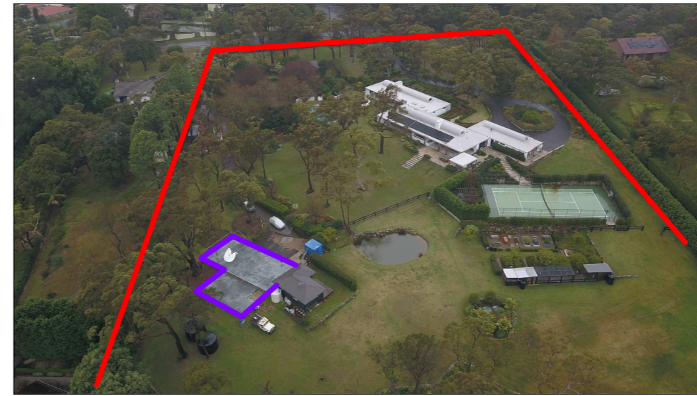
CONCRETE SLAB AND NO.17 MINKARA RD LOOKING EAST