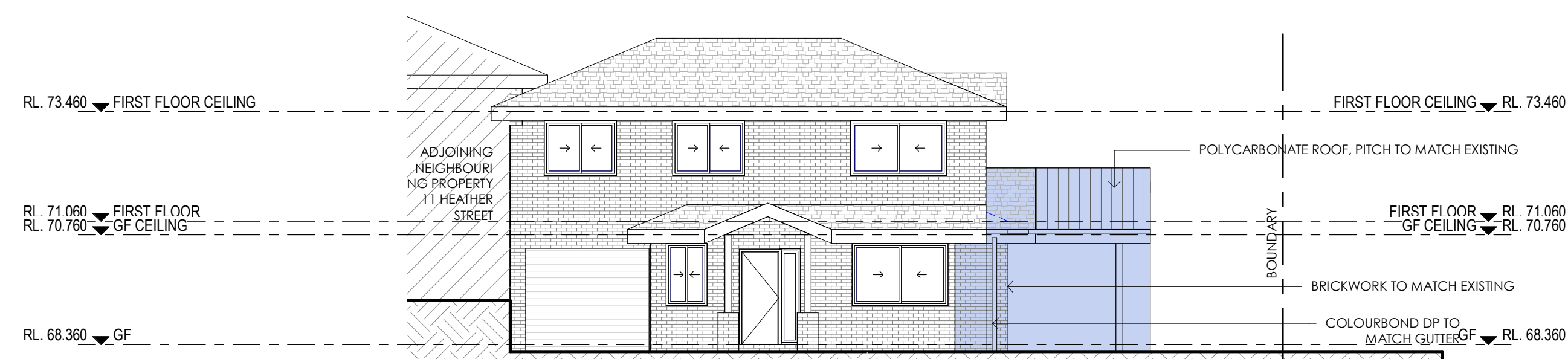
4 WEST ELEVATION DA100