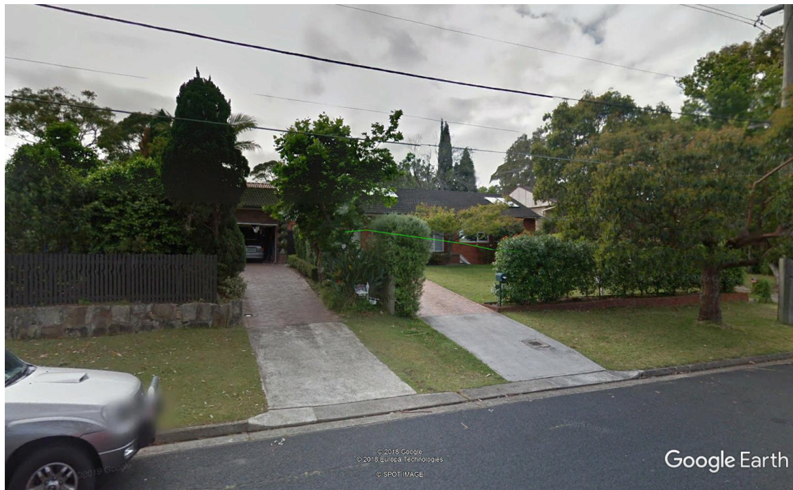
Subject Site as viewed from Romford Road

With regards to topography the subject site has a gradual fall from the rear boundary to the street. The applicant does not propose to alter the existing drainage arrangements as the proposed works are effectively contained over existing dwelling footprint.