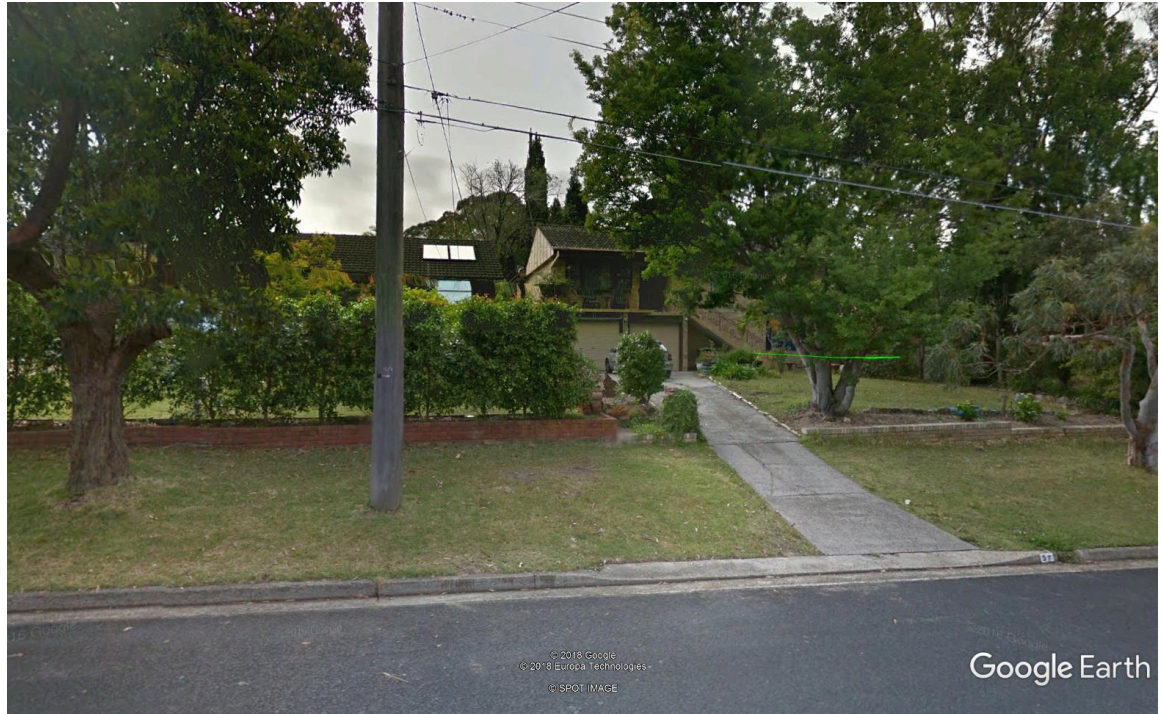
View of No 37 Romford Road