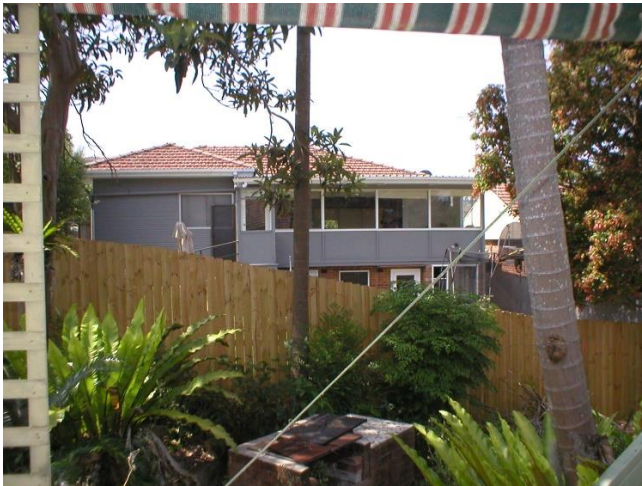
Rear property from No 6 rear deck