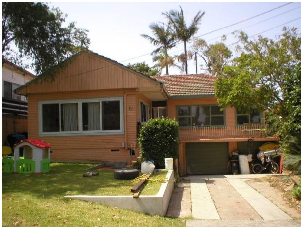
Front of 6 from Stephen Street above

Photos 6 Stephen Street Beacon Hill existing house and site