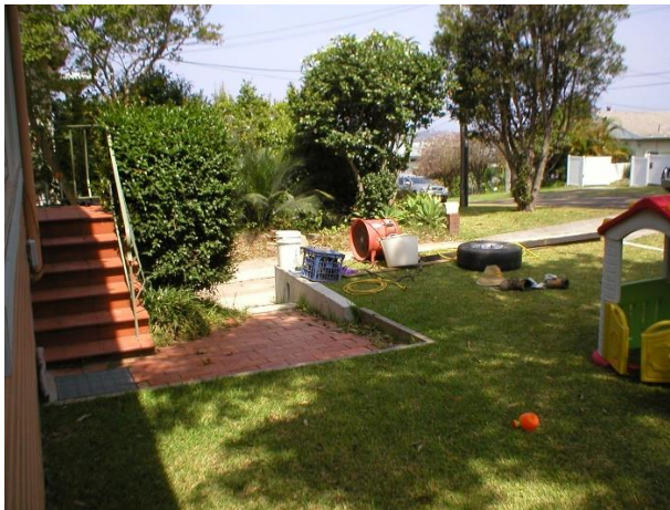
No 6 part front yard in front family room above