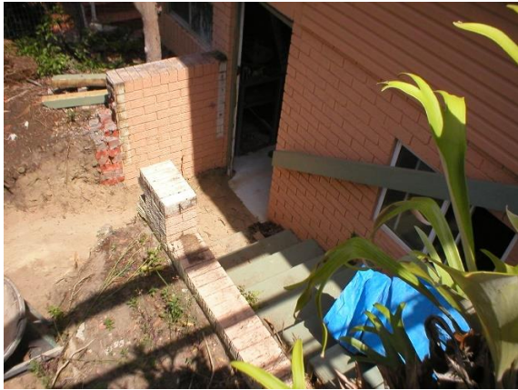
No 6 Rear of garage direction