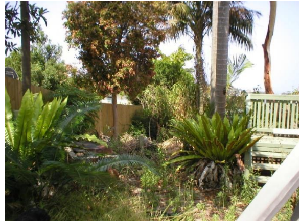
NO 6 Rear yard looking to rear fence in NE Rear yard now mainly levelled with lawn.