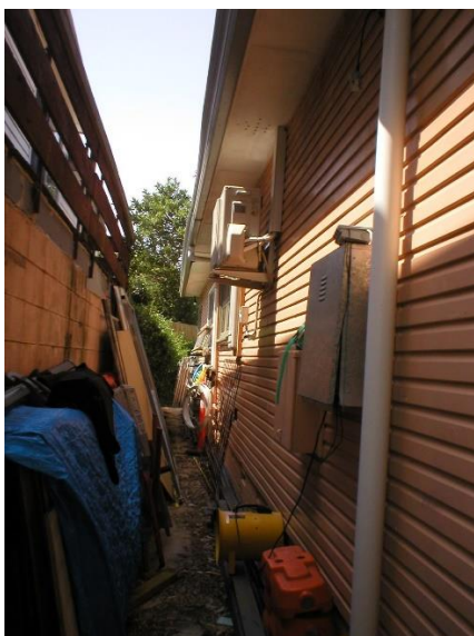
No 6 west side passage