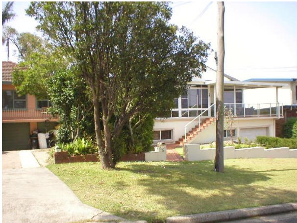
No 6 & 8 from Stephen Street above