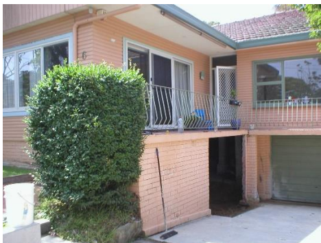
Family room outside