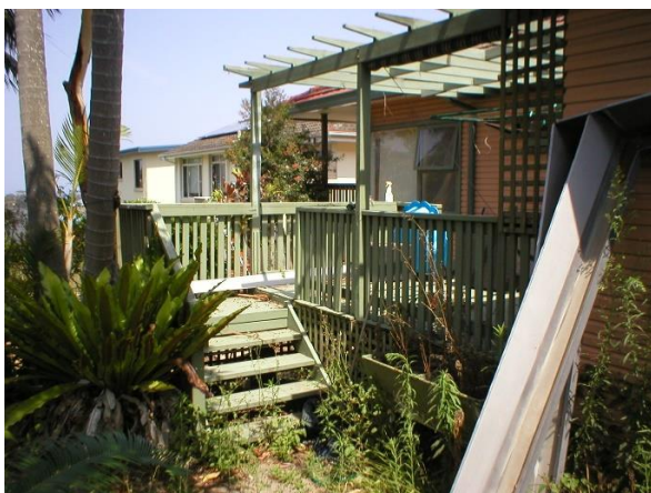
No 6 rear deck and pergola looking SE No 8 & 10 beyond, lawn now applies part levelled rear yard