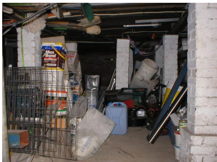
House foundations under proposed meals area.