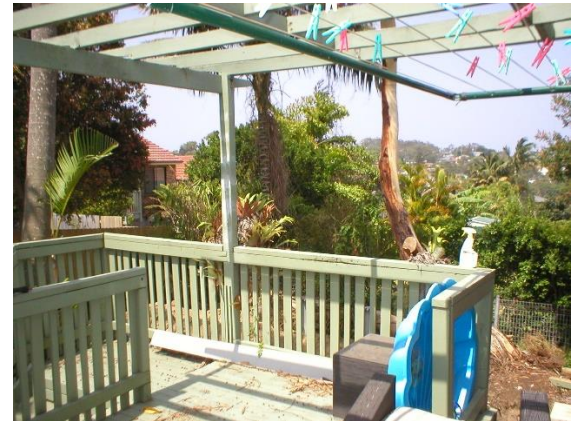
No 6 rear deck looking NE past no 8 rear yard