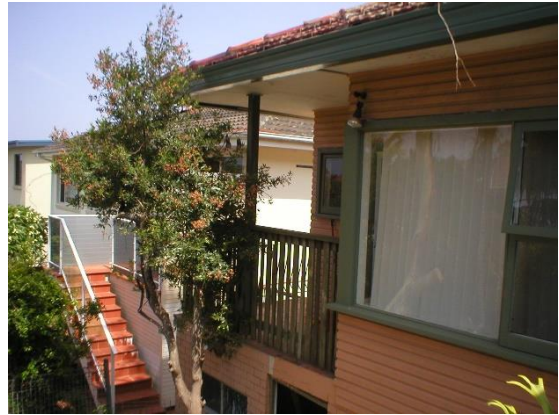
No 6 NE rear corner & part no 8