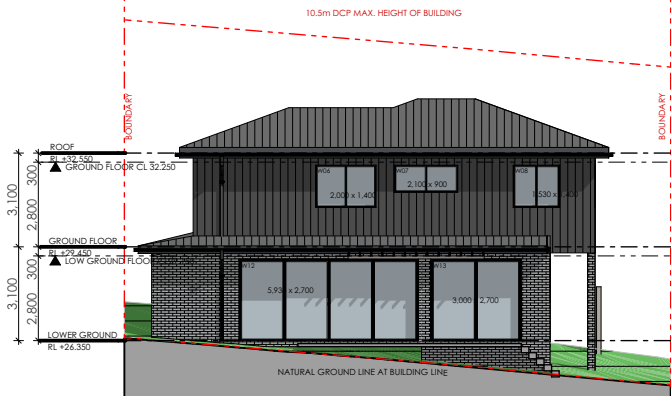
E EAST ELEVATION 1:250