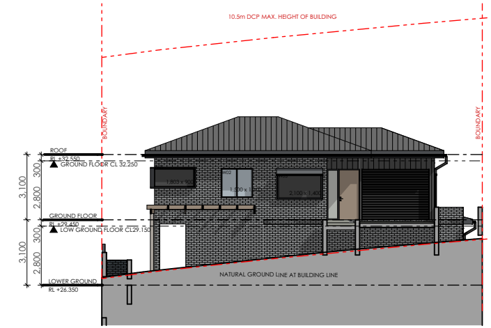
W WEST ELEVATION 1:250