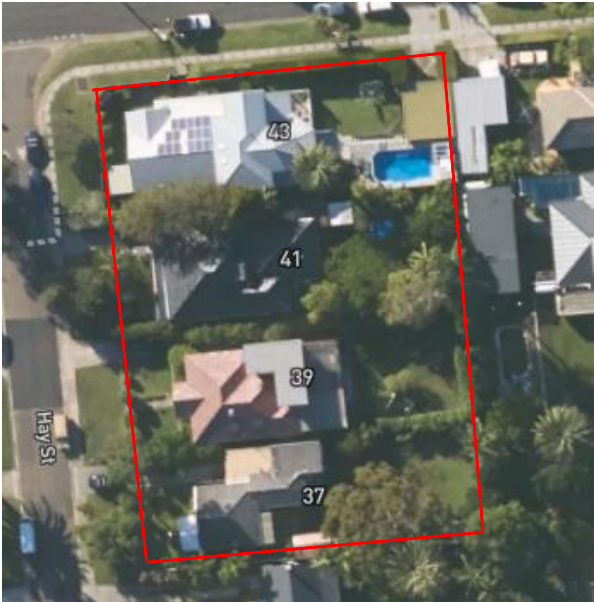
Figure 1: The subject site bordered by red line (metromap 2023).