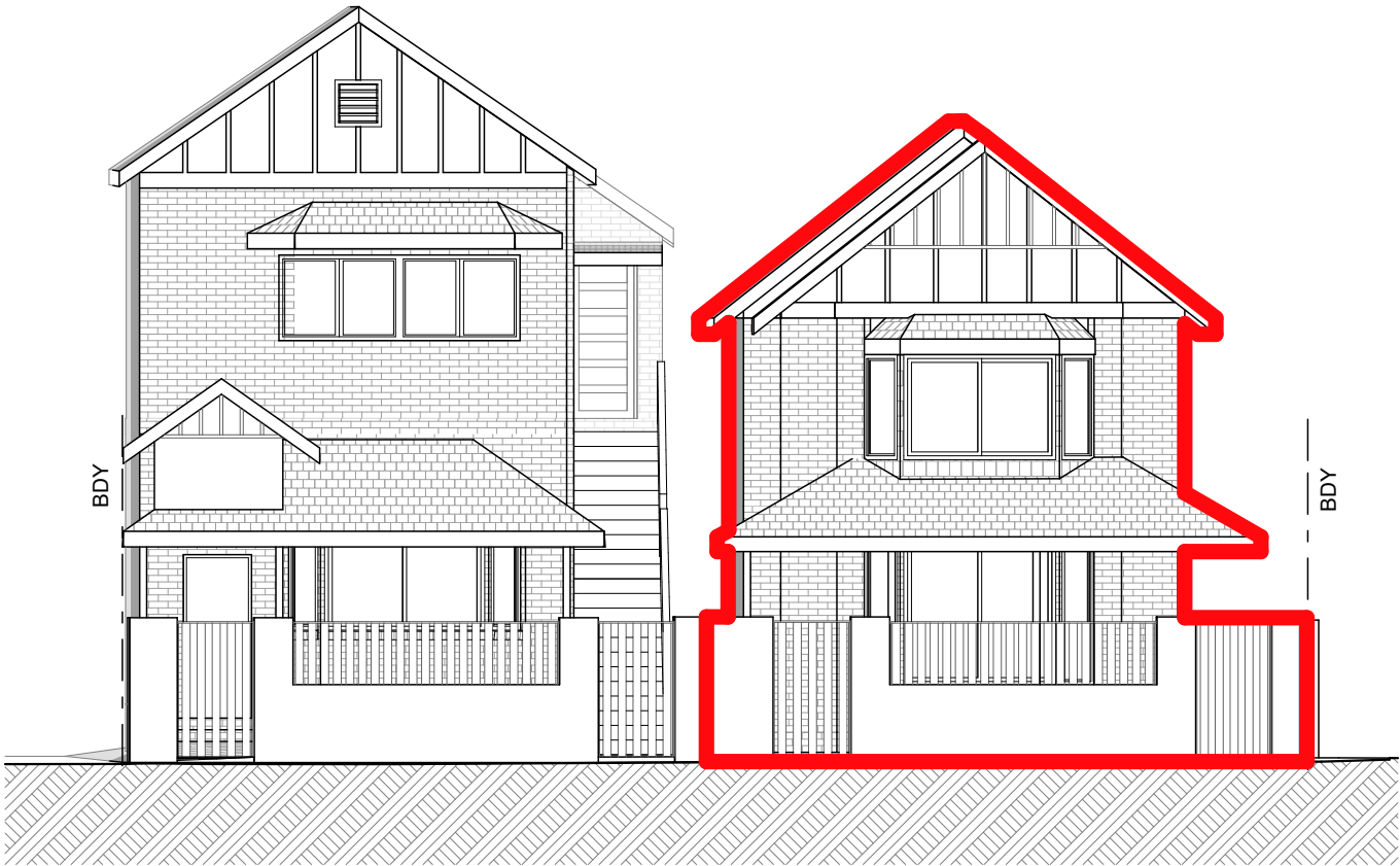
8 Alexander St - Existing 1:100

Roof - Shale Grey Gutters , downpipes,- Surfmist Eaves and posts - Surfmist Existing bricks clad with weatherboard cladding and painted Quarter Lexicon White Existing yellow cladding painted Quarter Lexicon White Existing timber windows painted Quarter Lexicon White Existing shingles on awnings to be replaced with colour bond roof - shale grey Front wall stone clad Front paling fence replaced with glass panels Front Gates Painted Quarter Lexicon White