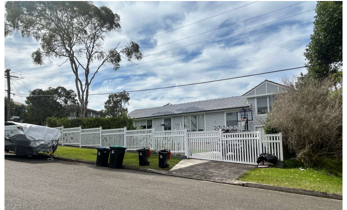
Churchill Crescent streetscape

Existing streetscape along Churchill Crescent towards existing home with trees, Boundary fencing and landscaped gardens to be maintained.