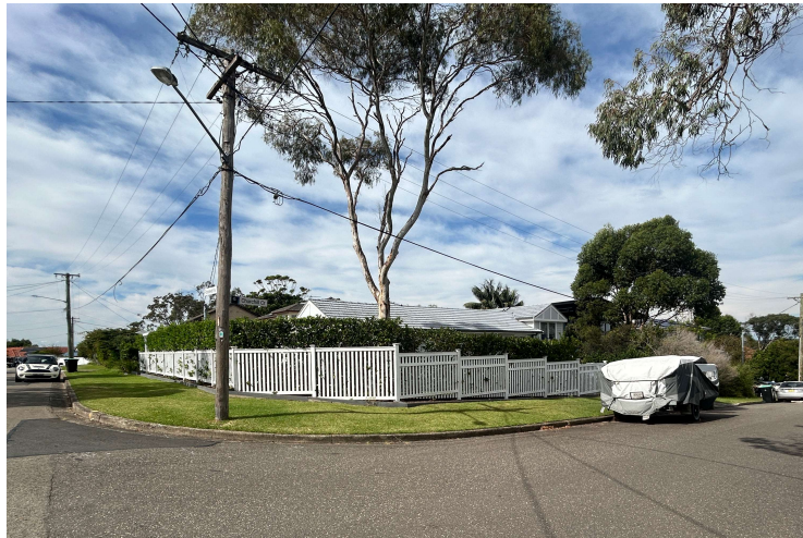
Roosevelt Avenue streetscape

view towards existing home at 17 Roosevelt Avenue, Allambie Heights including landscaped gardens and streetscape