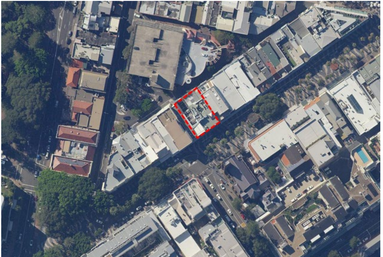
Figure 2: Aerial Location