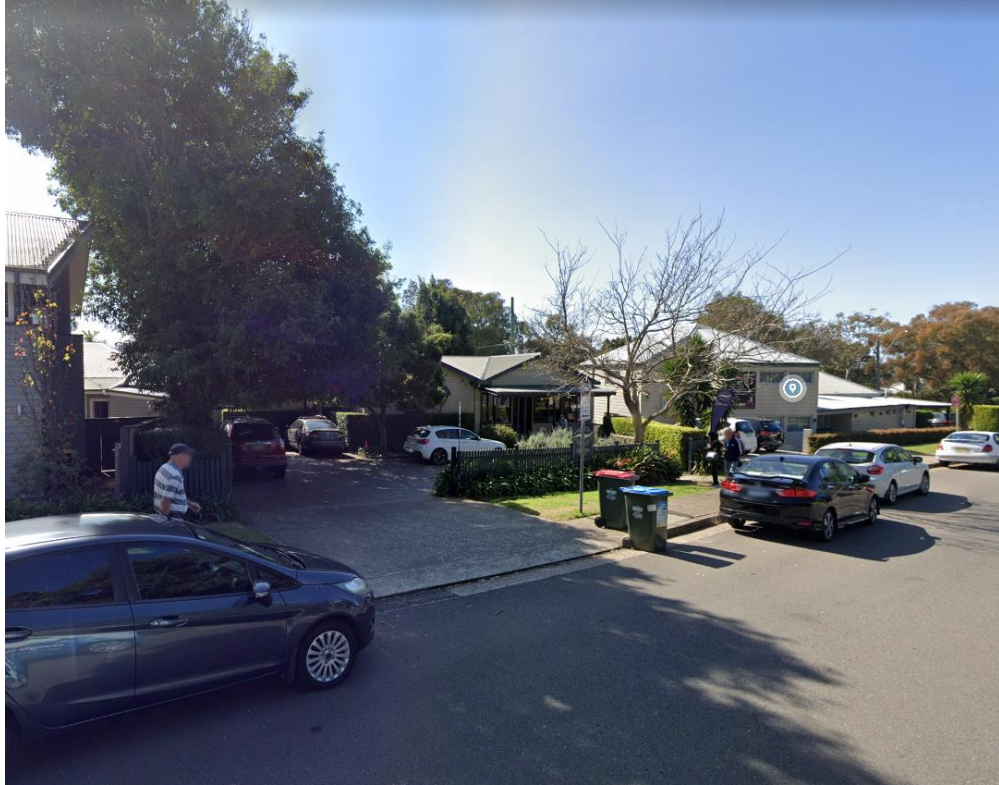
Figure 4 – Adjoining health services facility uses