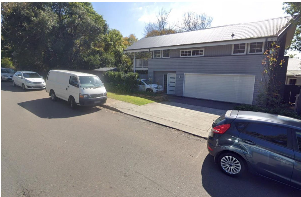
Figure 3 – Development site as viewed from Park Street