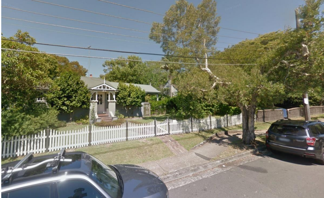
Figure 2 – Development site as viewed from Pittwater Road

The Sacred Heart Catholic Church is located opposite the site in Park Street with Woolworths Mona Vale and Mona Vale Town Centre further to the south east. The Mona vale Anglican Church is located opposite the development site in Pittwater Road as are a number of townhouse developments.