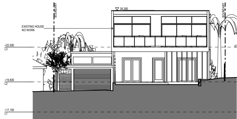
2 EAST 1:200