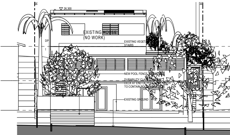
4 WEST 1:200