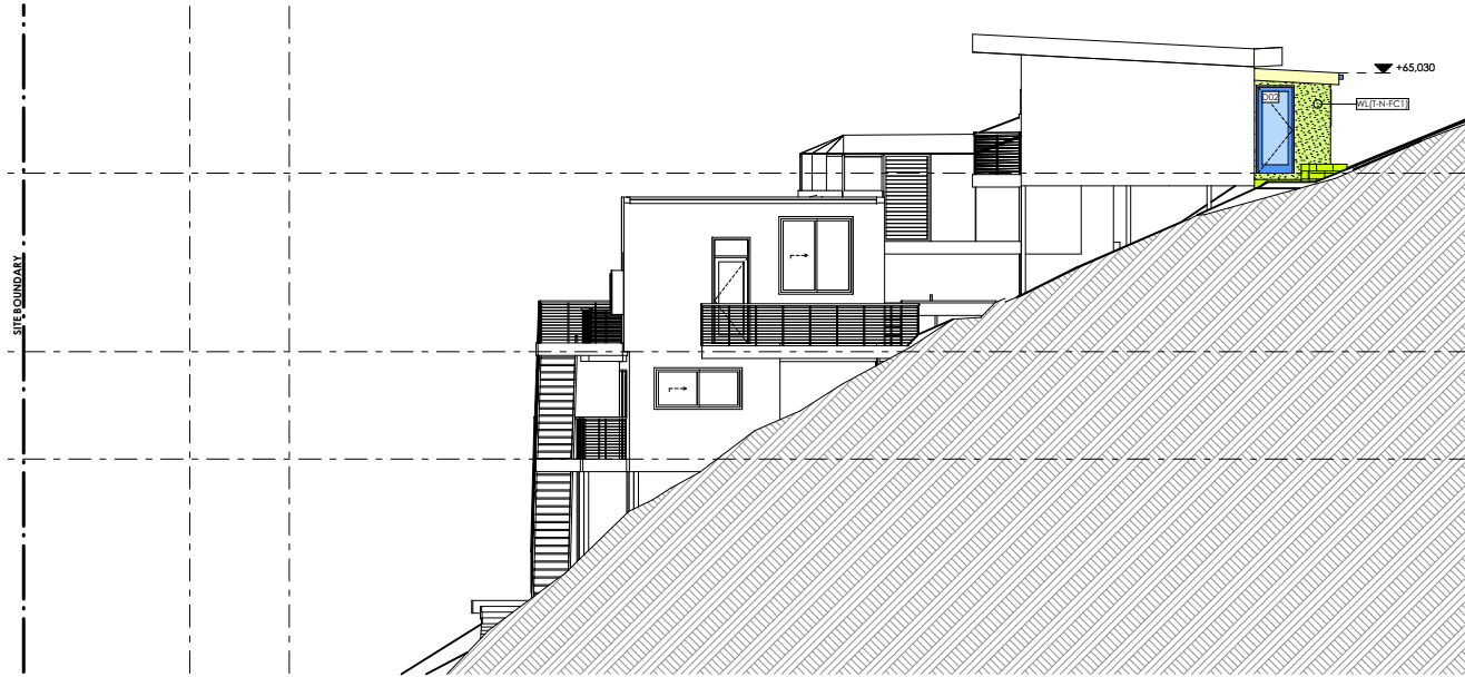
ELEVATION 3 1:200