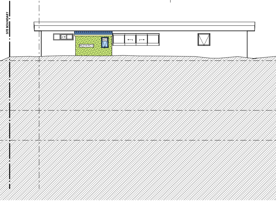
ELEVATION 2 1:200