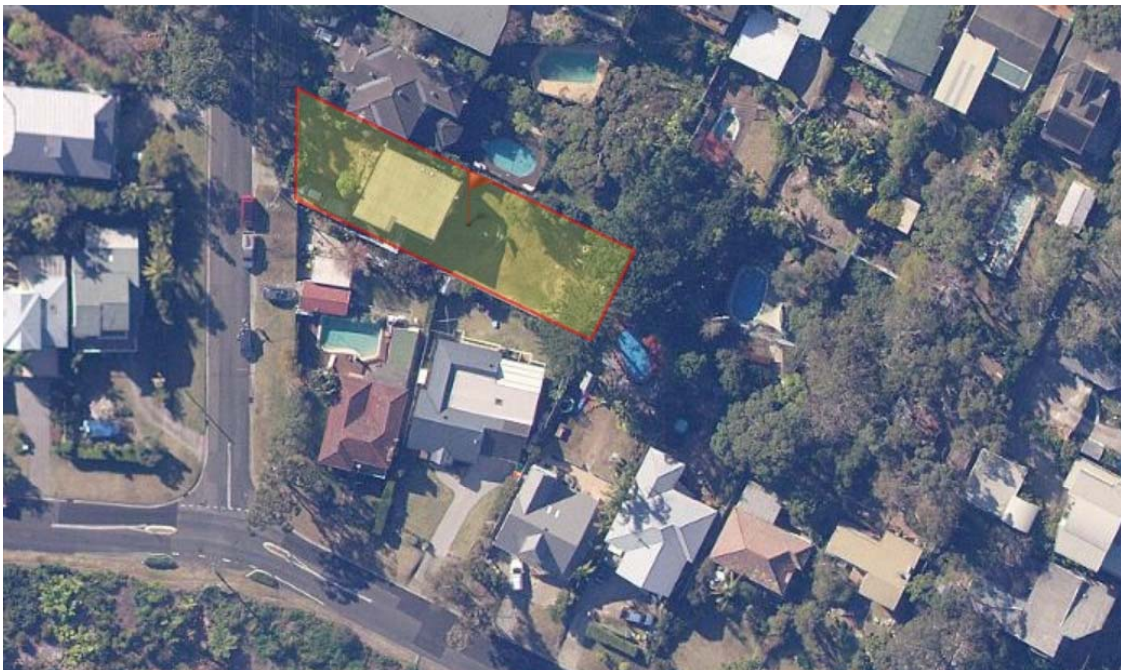
Image 8. Aerial View

Furthermore, it is noted that the proposed secondary dwelling is only a single storey building. The bulk and scale of the built form is minimised, and a reasonable level of privacy, amenity and solar access is provided.