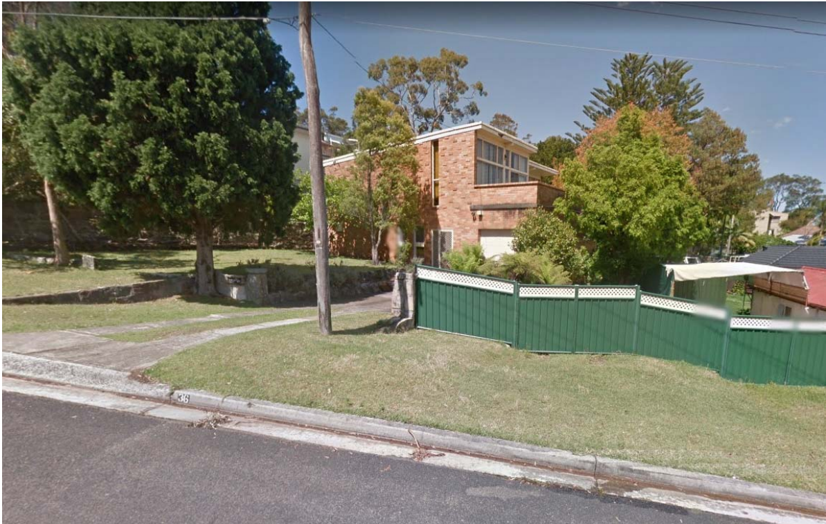
Image 1. Existing dwelling at 36 Allawah Avenue

A two-storey dwelling and an attached garage exist on the property. There is a vehicle crossing on Allawah Avenue, and a driveway runs along the Southern boundary that leads into the attached garage. Refer to image 1 and image 2.