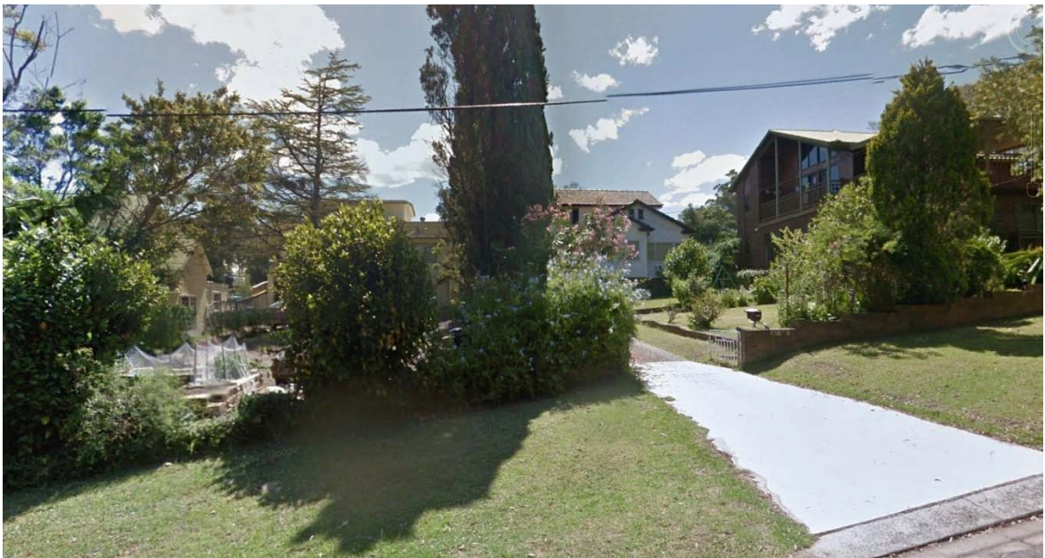
Image 7. Streetscape of Allawah Avenue continued