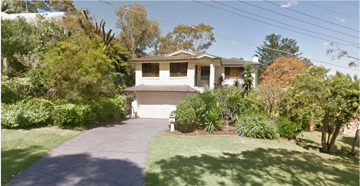
Image 3. A Two-storey dwelling at 34 Allawah Avenue

To the immediate North of the subject property, at 34 Allawah Avenue, a two-storey dwelling exists. Refer to the image 3.