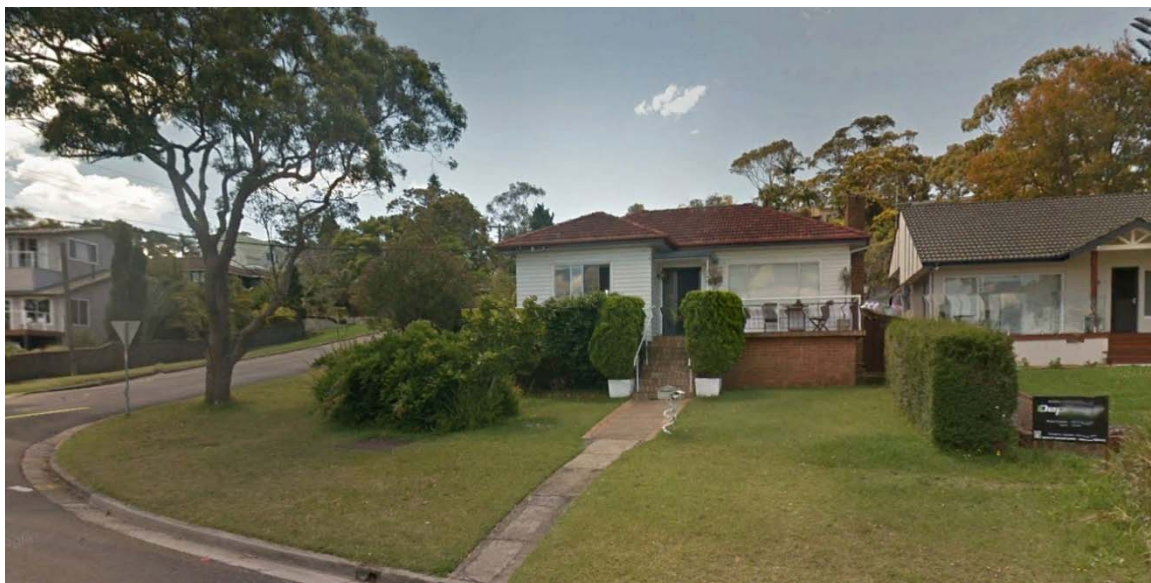
Image 4. A single storey dwelling at 186 Woorarra Avenue

To the immediate South of the subject property, at 186 Woorarra Avenue, a single-storey dwelling exists. Refer to the image 4.