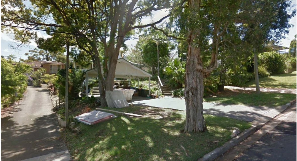
Image 6. Streetscape of Allawah Avenue

The remainder streetscape of Allawah Avenue is an amalgamation of one and two-storey dwellings versatile in architectural styles, character, materials, finishes, bulk and scale. Refer to image 6 and image 7.