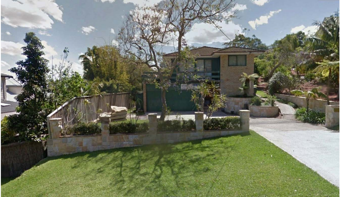
Image 5. A two-storey dwelling at 39 Allawah Avenue

Across the road of the subject property, at 39 Allawah Avenue, a two-storey dwelling exists. Refer to image 5.