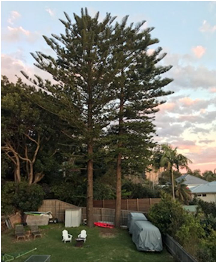
Image 9. Norfolk Trees at rear

Additionally, there is noncompliance to setback from trees. Norfolk pine trees at the rear are 18 metres in height. The canopy of these trees is located higher than the ridge of the proposed secondary dwelling. Further, the proposed secondary dwelling will be constructed as a pier and joist system, which will have a minimum impact on the root system of these trees. There will be no adverse impact on the trees when deliberating on a variation of the tree setback requirement. Refer to image 9.