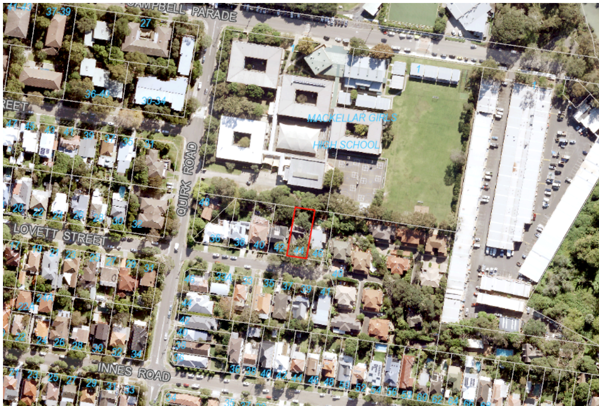
Image 2: Site location – 44 Lovett Street, Manly Vale – Red Polygon