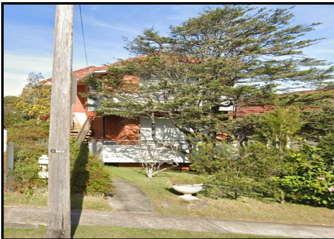
View of the adjoining western property – No 9 Ethel Street