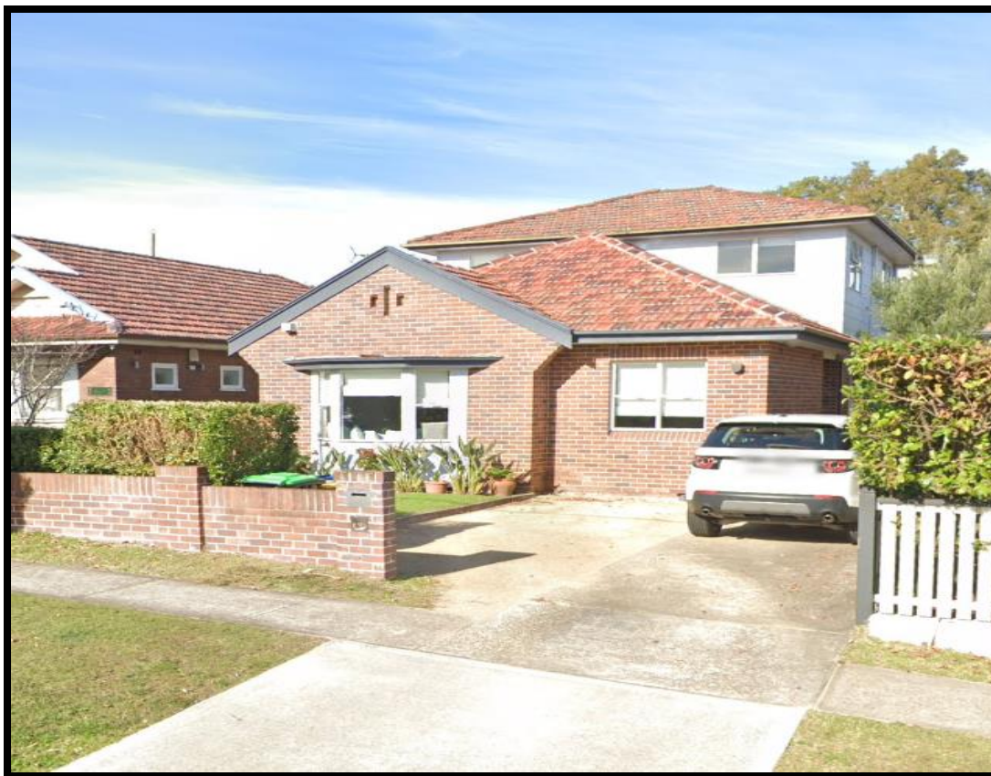
View of the adjoining eastern property – No 5 Ethel Street