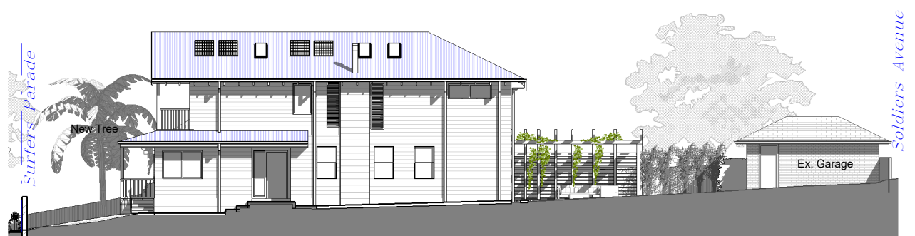
Proposed West Elevation - 1:250