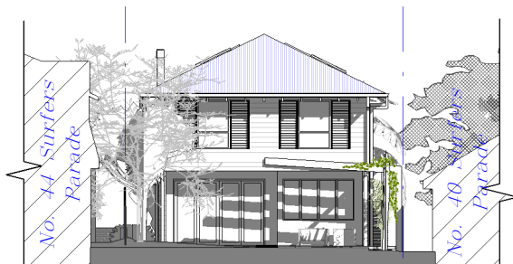
Proposed South Elevation - 1:250