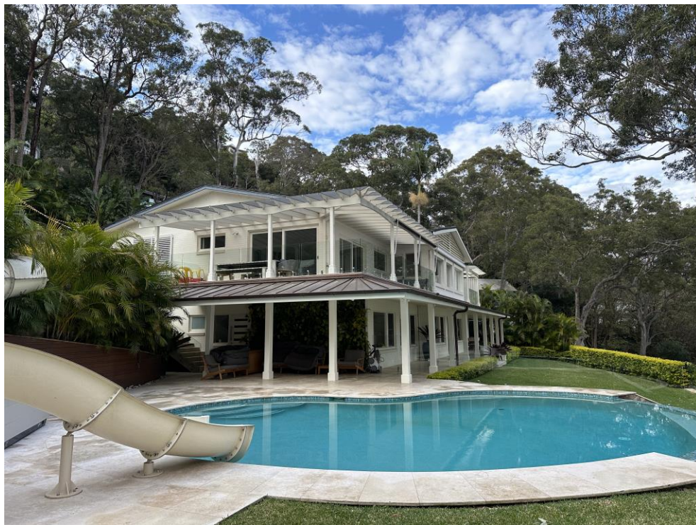
Figure 5: The subject site, looking south-east from the rear garden.