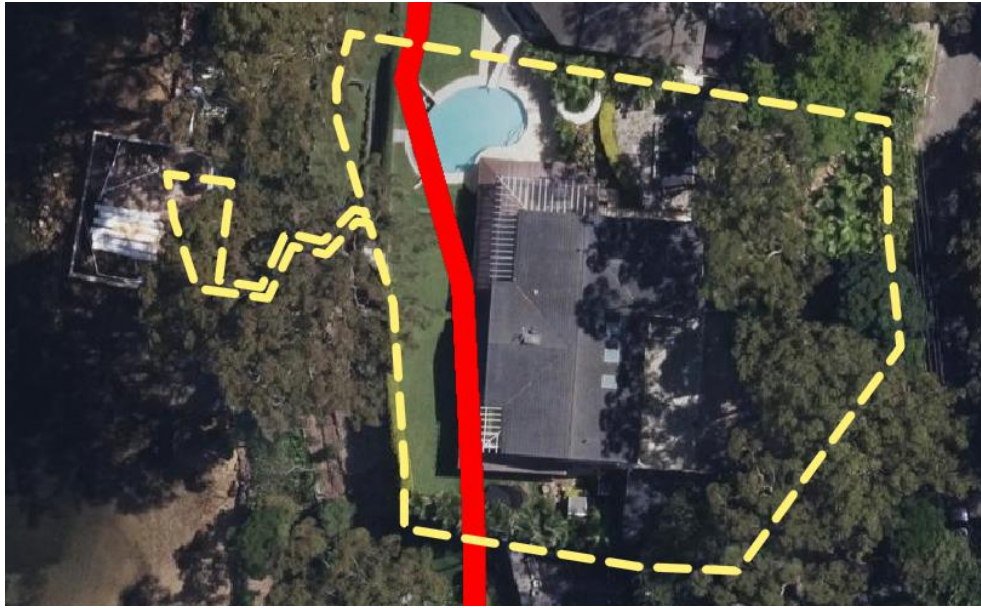
Figure 13: Extract from the Pittwater LEP 2014 foreshore building line map

The relocated swimming pool is located within the foreshore area and swimming pools are permitted in the mapped area by clause 7.8(2).