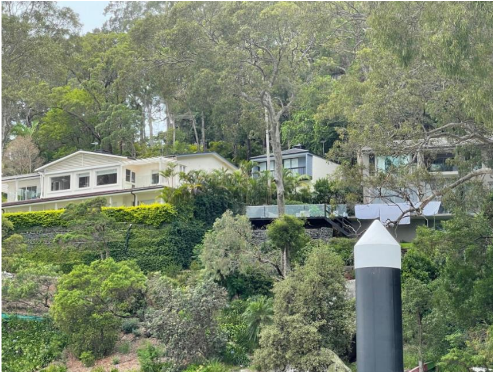
Figure 8: The rear of the subject site, looking north-east from Pittwater.