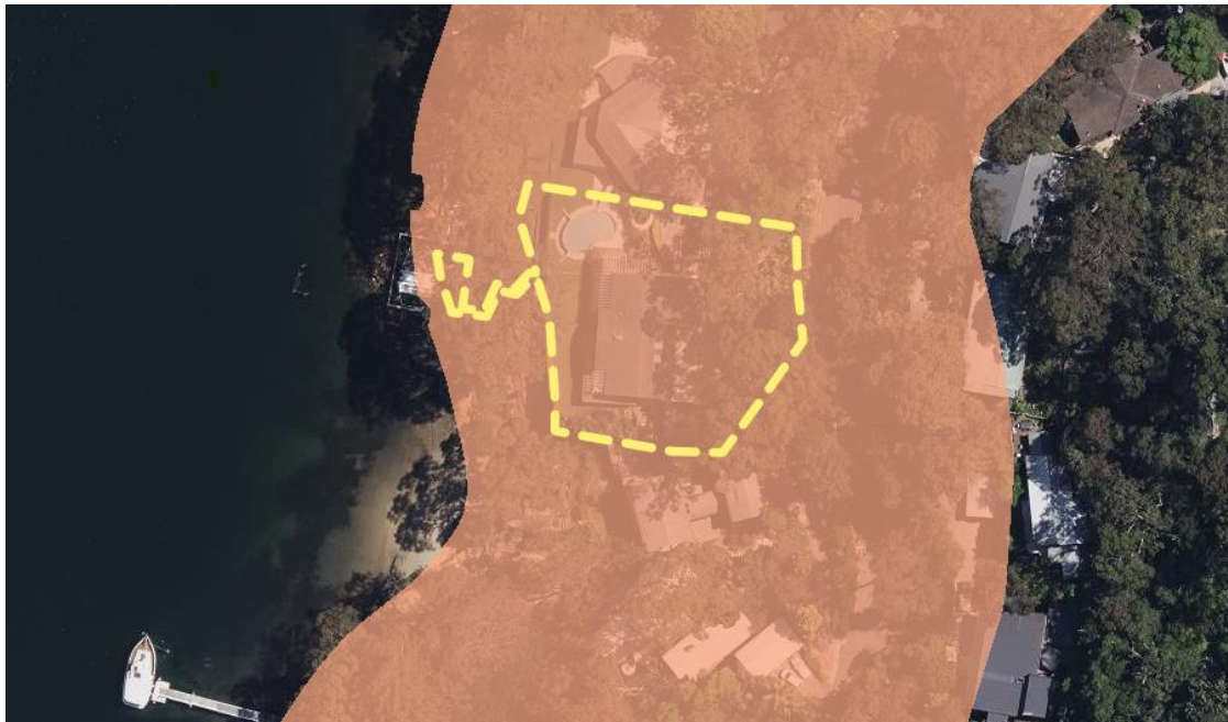
Figure 11: Extract – SEPP (Resilience and Hazards) Coastal Management.

The site is mapped as 'Coastal Environment Area' and 'Coastal Use Area' and accordingly the consent authority must consider clause 2.10, 2.11 and 2.12 of the SEPP.