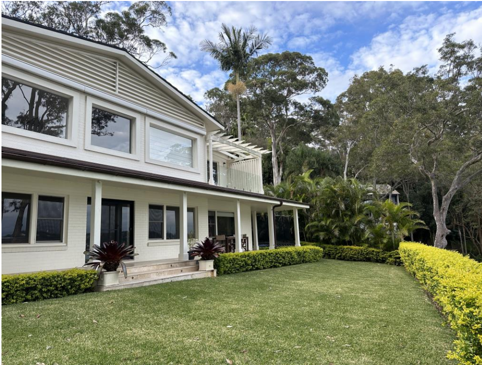
Figure 6: The dwelling and rear garden, looking south.