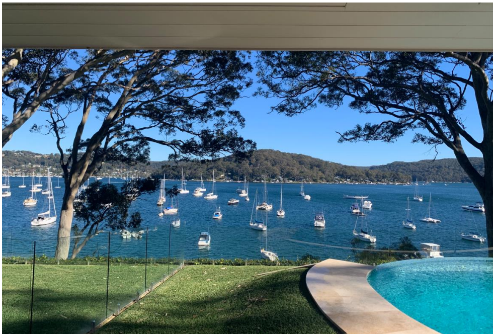
Figure 7: Views across Pittwater, looking west.