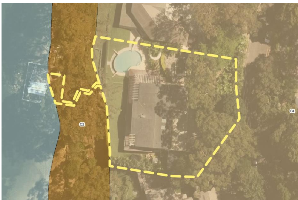
Figure 12: Extract from the Pittwater LEP 2014 zoning map

The proposed development is for a new swimming pool, ancillary to a dwelling house and dwelling houses are permitted with consent in the C4 zone.