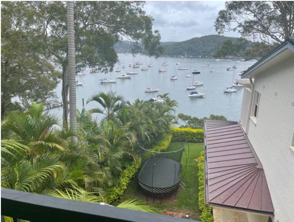
Figure 9: Views across Pittwater, looking west.