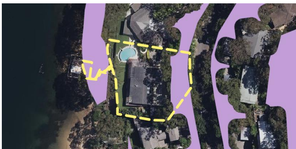
Figure 10: Extract – Biodiversity Values Map

The Biodiversity Conservation Act 2016 and Regulations 2017 aim to provide a balanced approach to land management and biodiversity conservation for identified land in NSW. The legislation sets out impact thresholds which trigger the Biodiversity Offsets Scheme (BOS). If it is determined that the BOS is triggered, an accredited assessor must prepare a Biodiversity Development Assessment Report (BDAR), which sets out impacts and offset obligations. The subject site is identified on the biodiversity values map, as illustrated below.