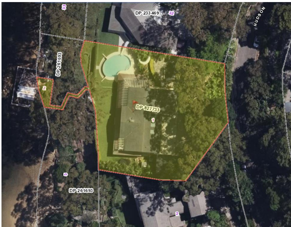
Figure 1. The site and its immediate surrounds