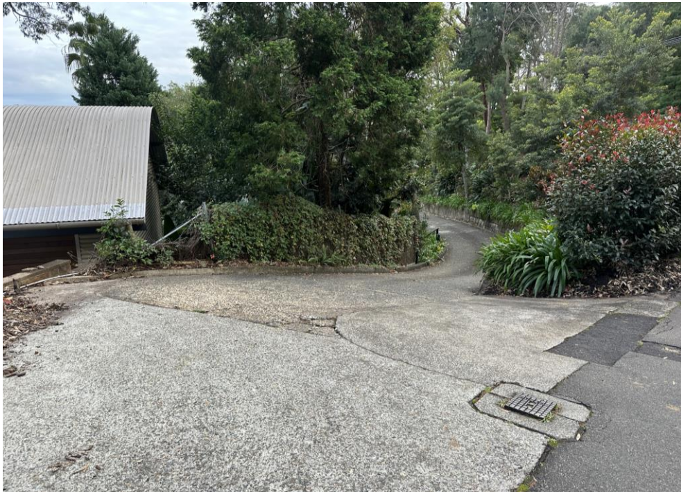
Figure 4. The access driveway to the subject site, looking north-west from Hudson Parade.