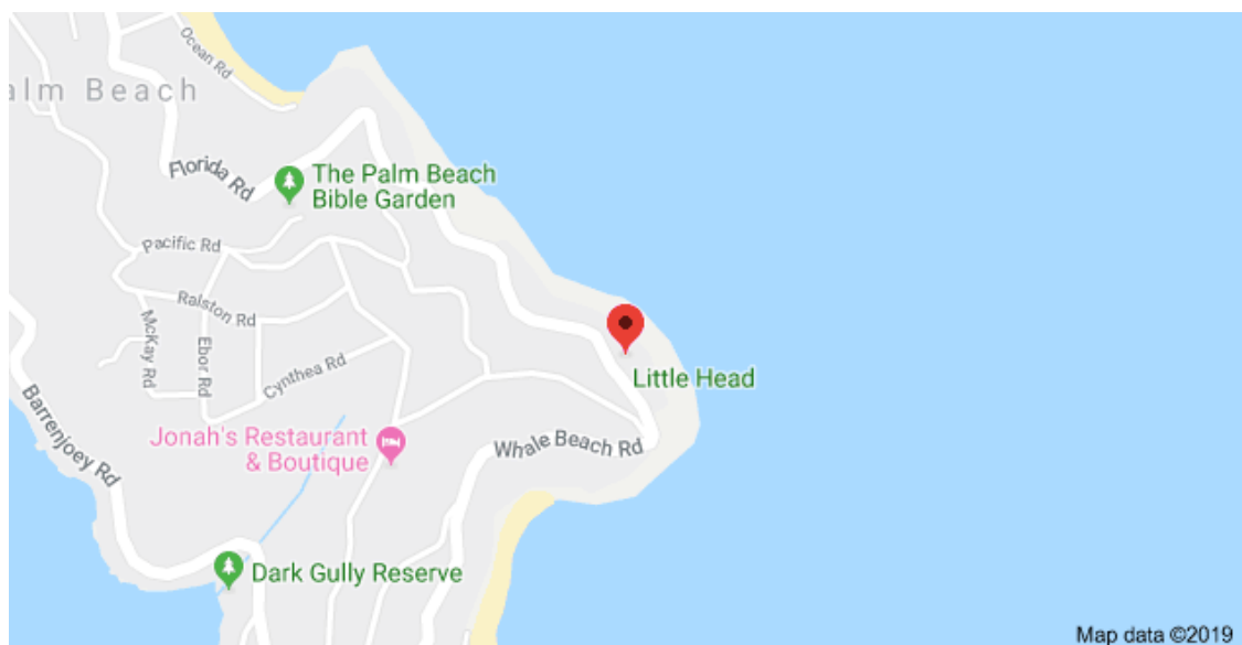
Figure 1: The location of the subject site (www.googlemaps.com).