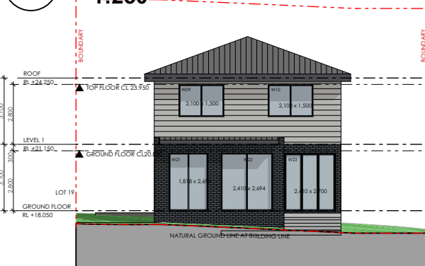
4 EAST ELEVATION 1:250