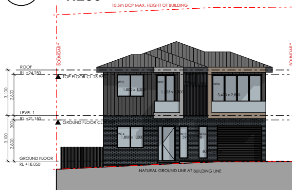
3 WEST ELEVATION 1:250