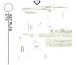
KEY PLAN NTS