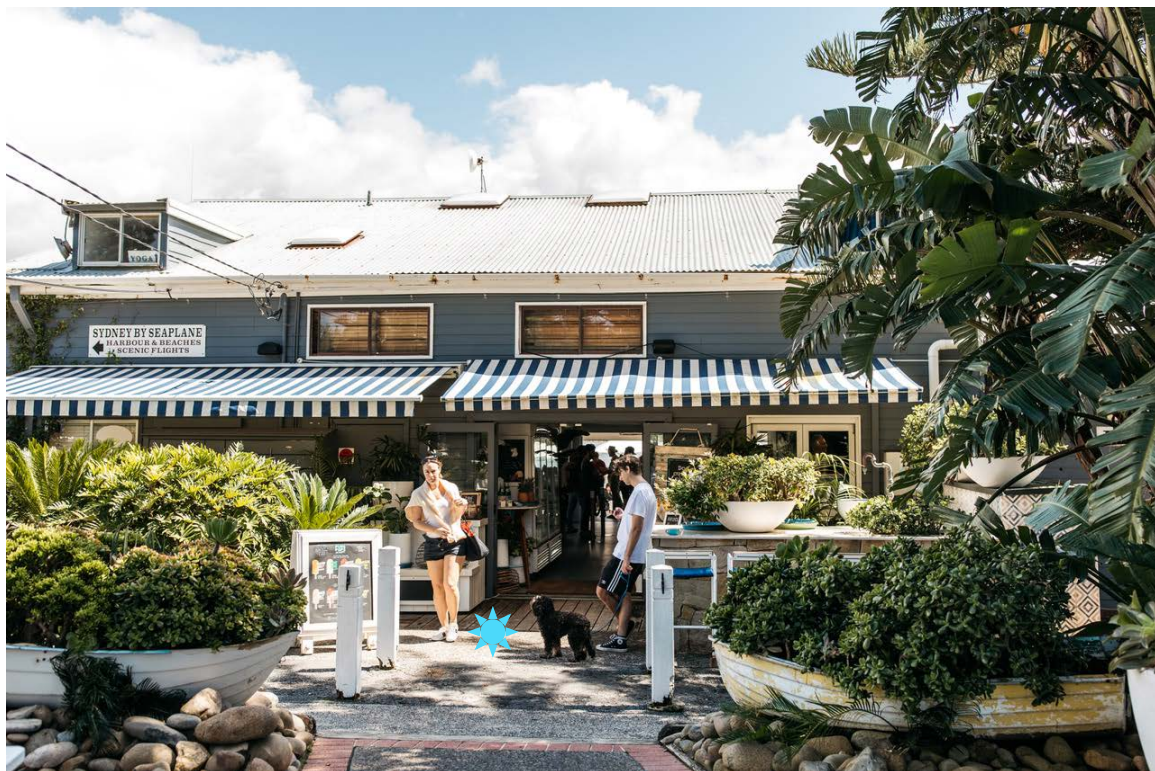
Figure 2 – Front Entry View