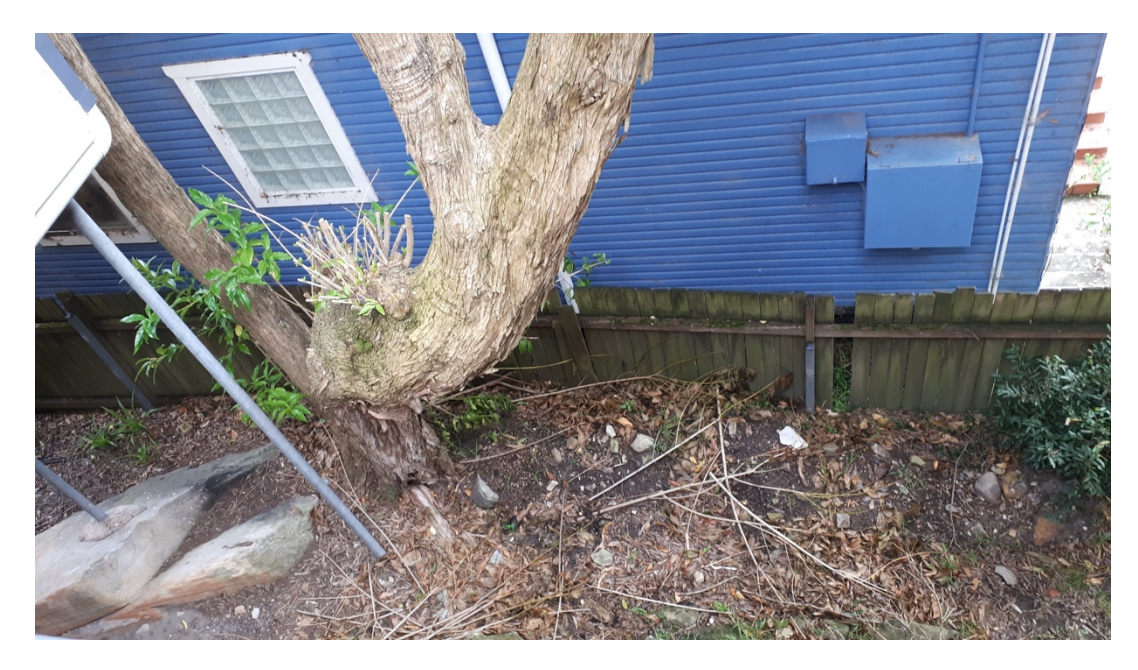
Photo 2: T1 Fiddlewood. Base of tree less than 2 metres from property No 10 Horning Pde (blue facade).