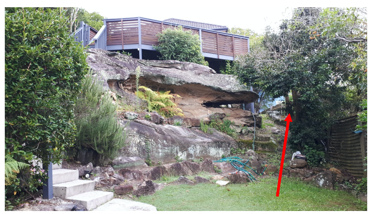
Photo 3: T2: Camellia sasanqua. Tree less than 5 metres in height.