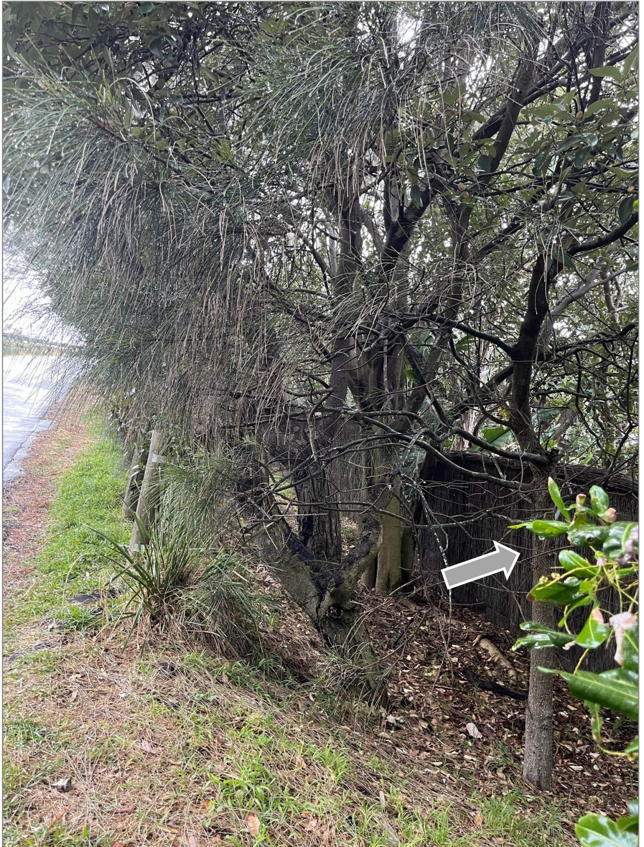
Plate 3 — Tree 8 – Arrow notes Tree 8, requires removal for sight lines.