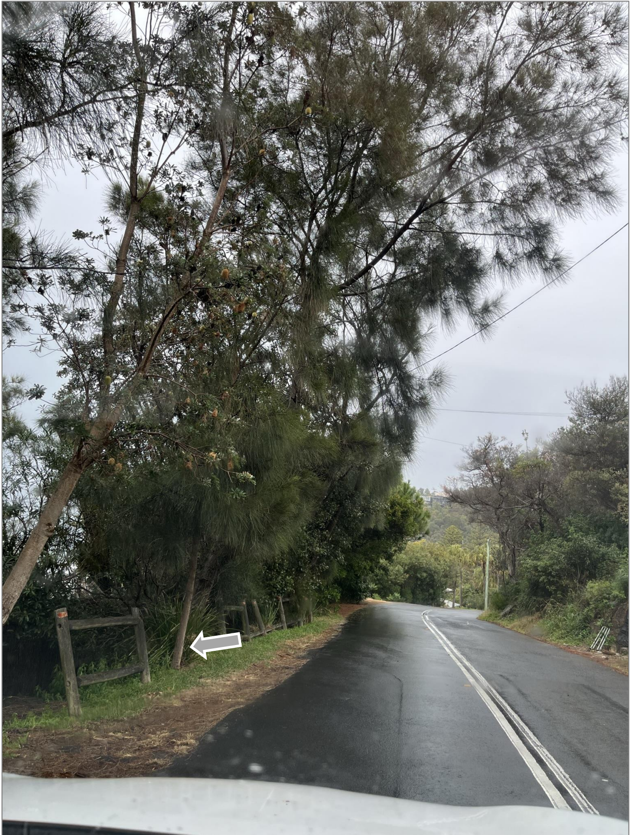
Plate 1 – Arrow notes Tree 15. Crown raise pruning will facilitate sight lines.