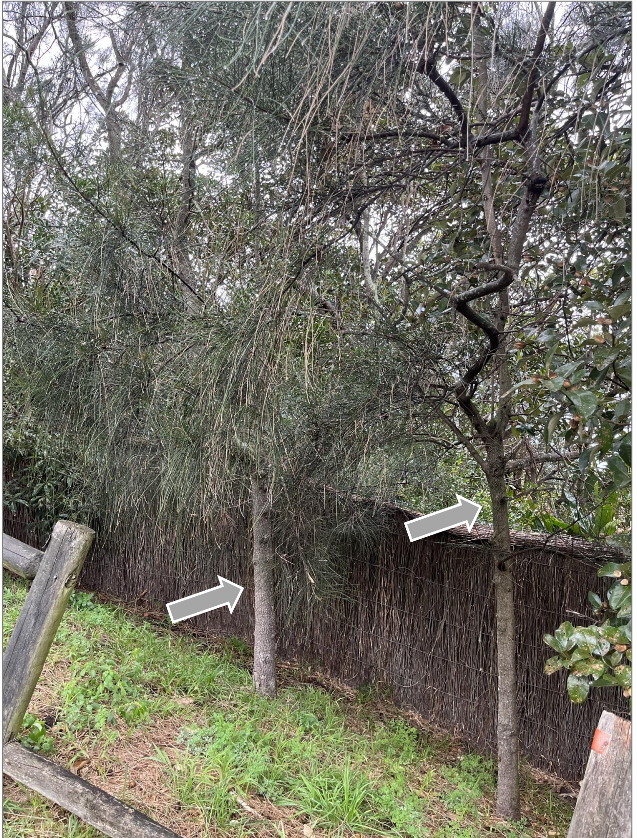
Plate 5 – Tree 17 and 18 – Arrow notes Tree 17 and 18, require minor pruning for sight lines.