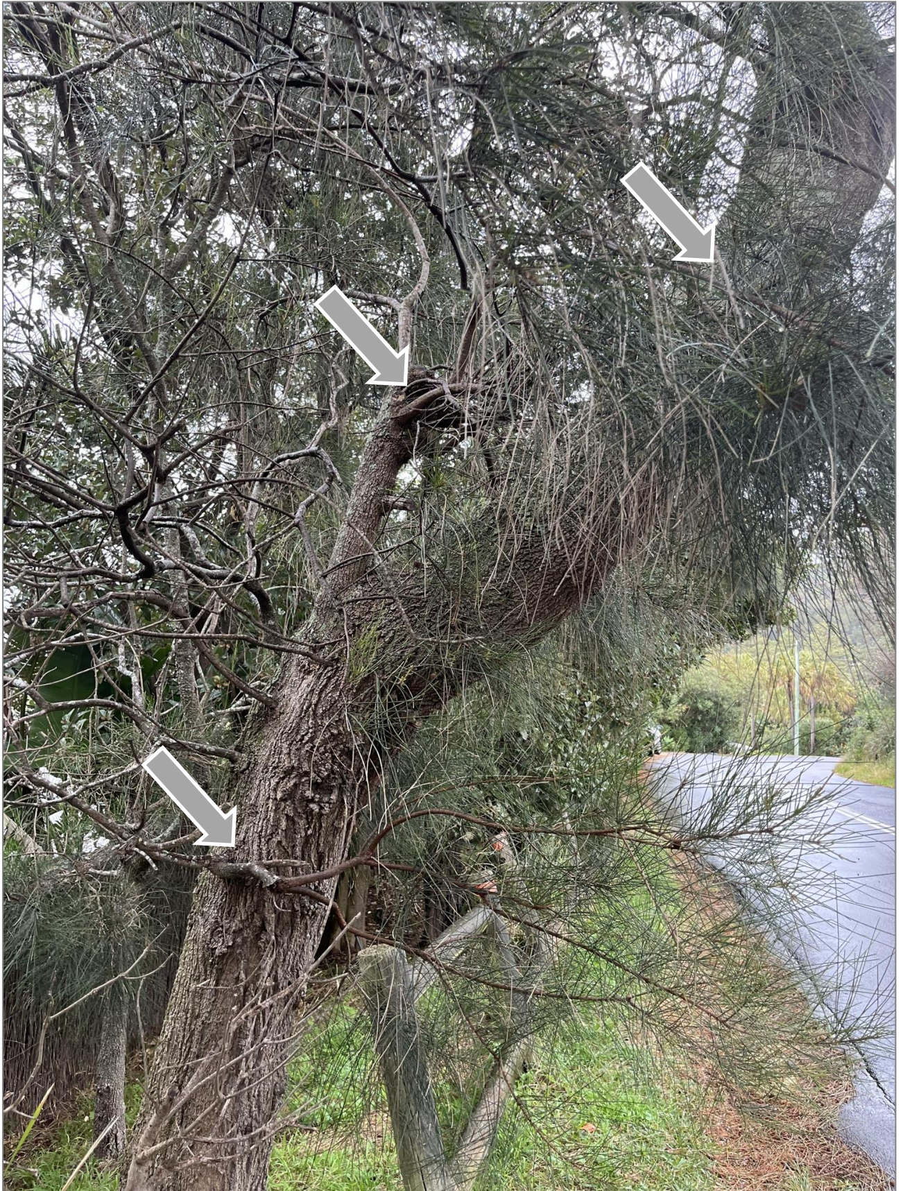
Plate 2 – Tree 12 - Arrows note small diameter branches that once pruned will facilitate clear sight lines.