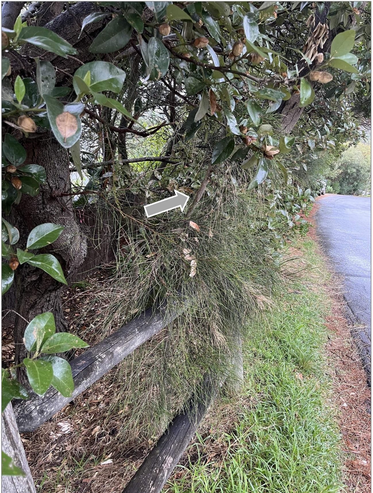
Plate 4 – Tree 16 – Arrow notes Tree 16, requires removal for sight lines.