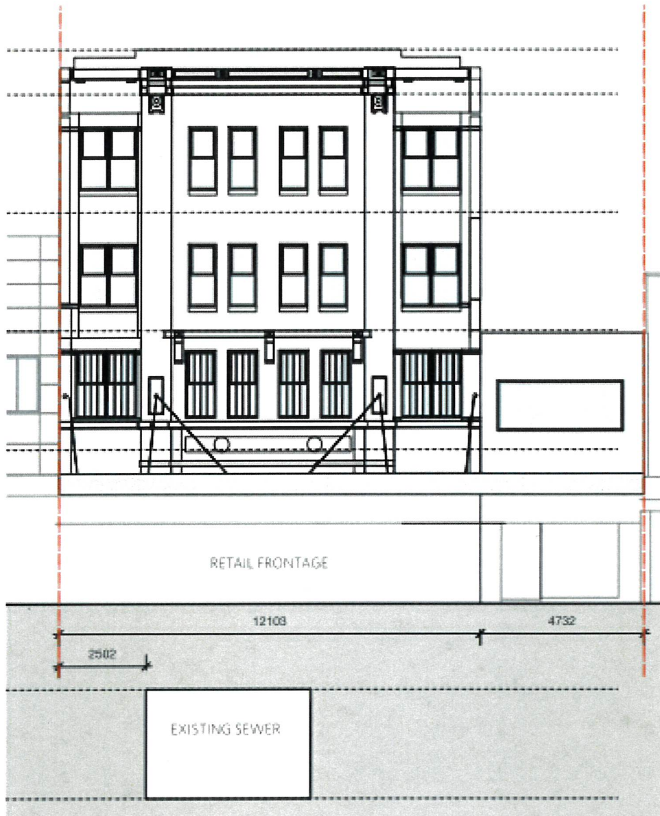
Plate 2.0 From Durbach Block Jagers Elevation indicating sewer relationship. Dimensions are subject to confirmation.

The proposed alterations to the building are described in drawings prepared by Durbach Block Jagers ref –DA-00, 03, 04, 05, 11, 12, 13, 15, 16, 17, 26(E).