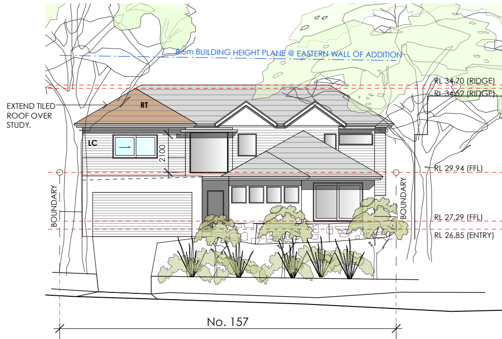
STREET (EAST) ELEVATION