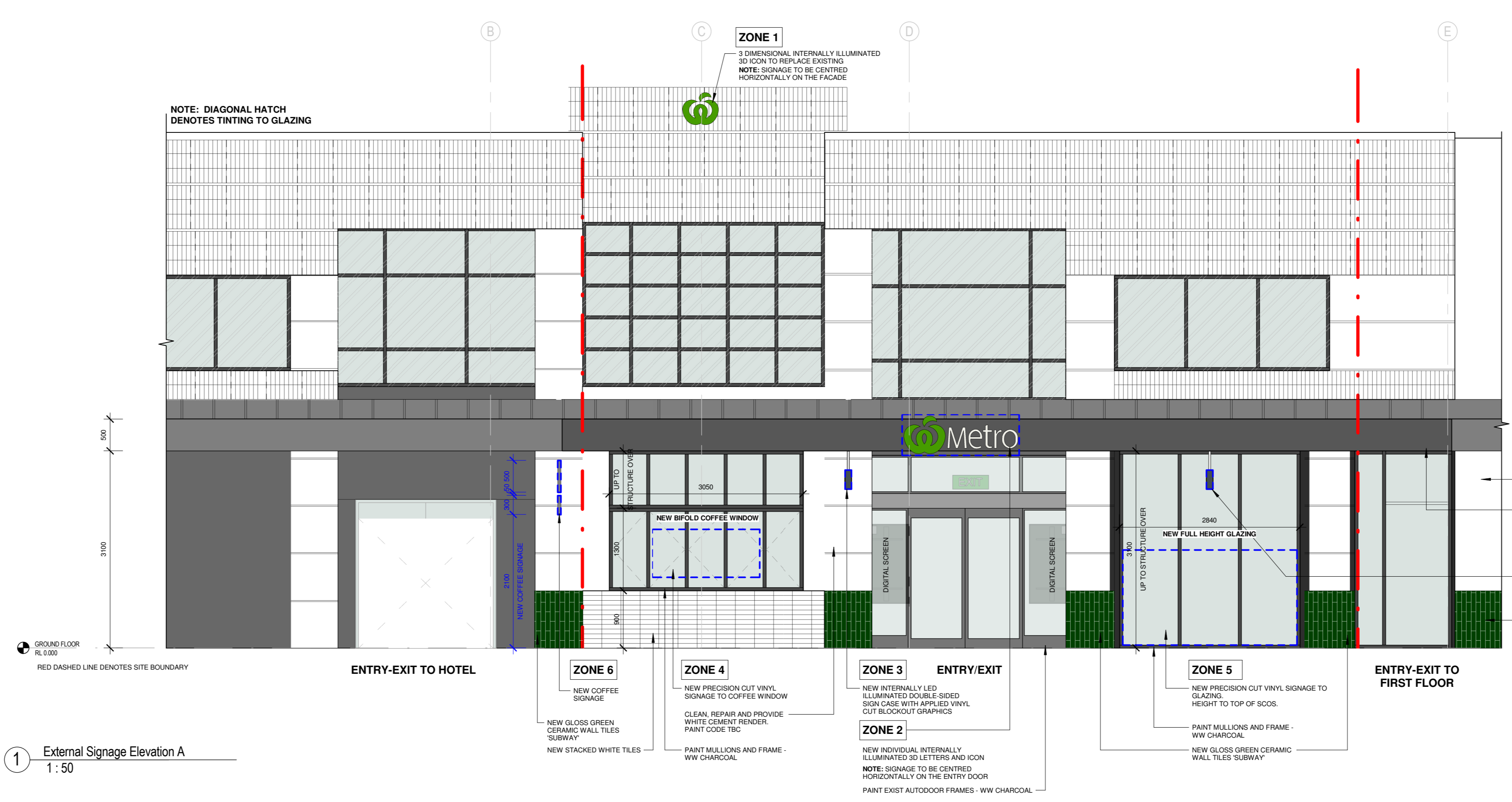
External Signage Elevation A 1:50