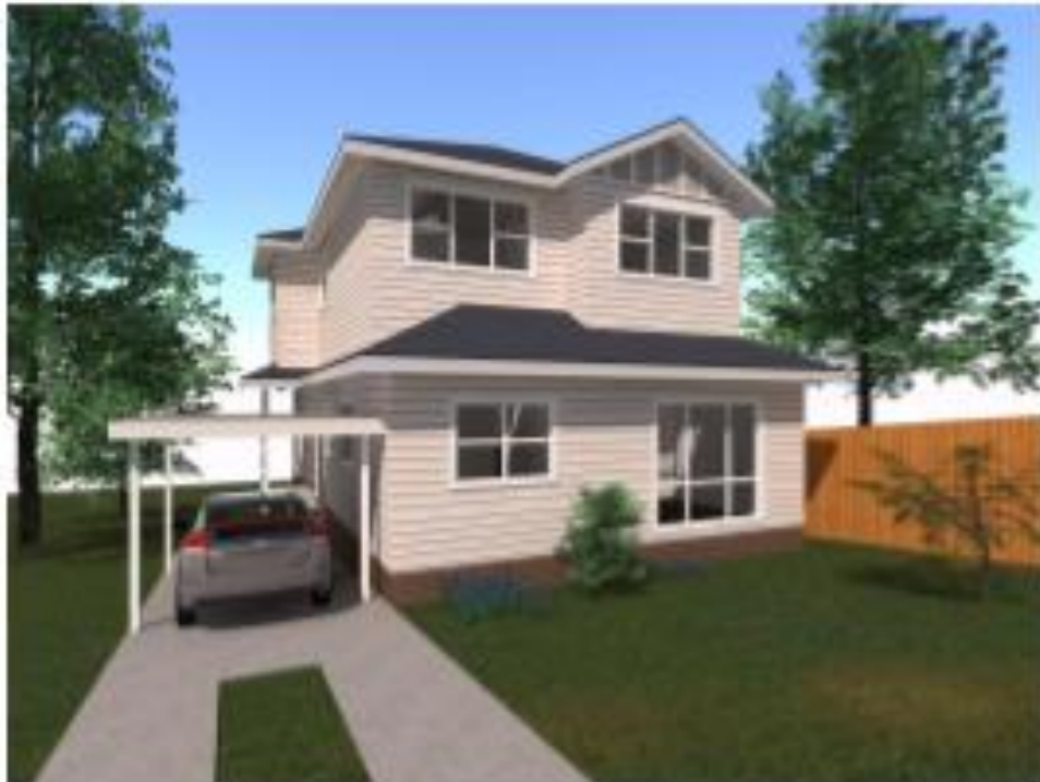
Proposed Streetscape elevation