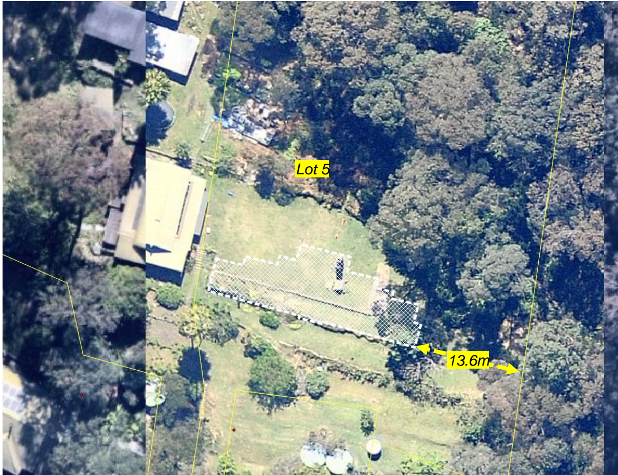
Photo 2 is a closer view of the vegetation in the area. The proposed house footprint is shown in white.

Table 1 outlines the vegetation orientation and distance from the development area.