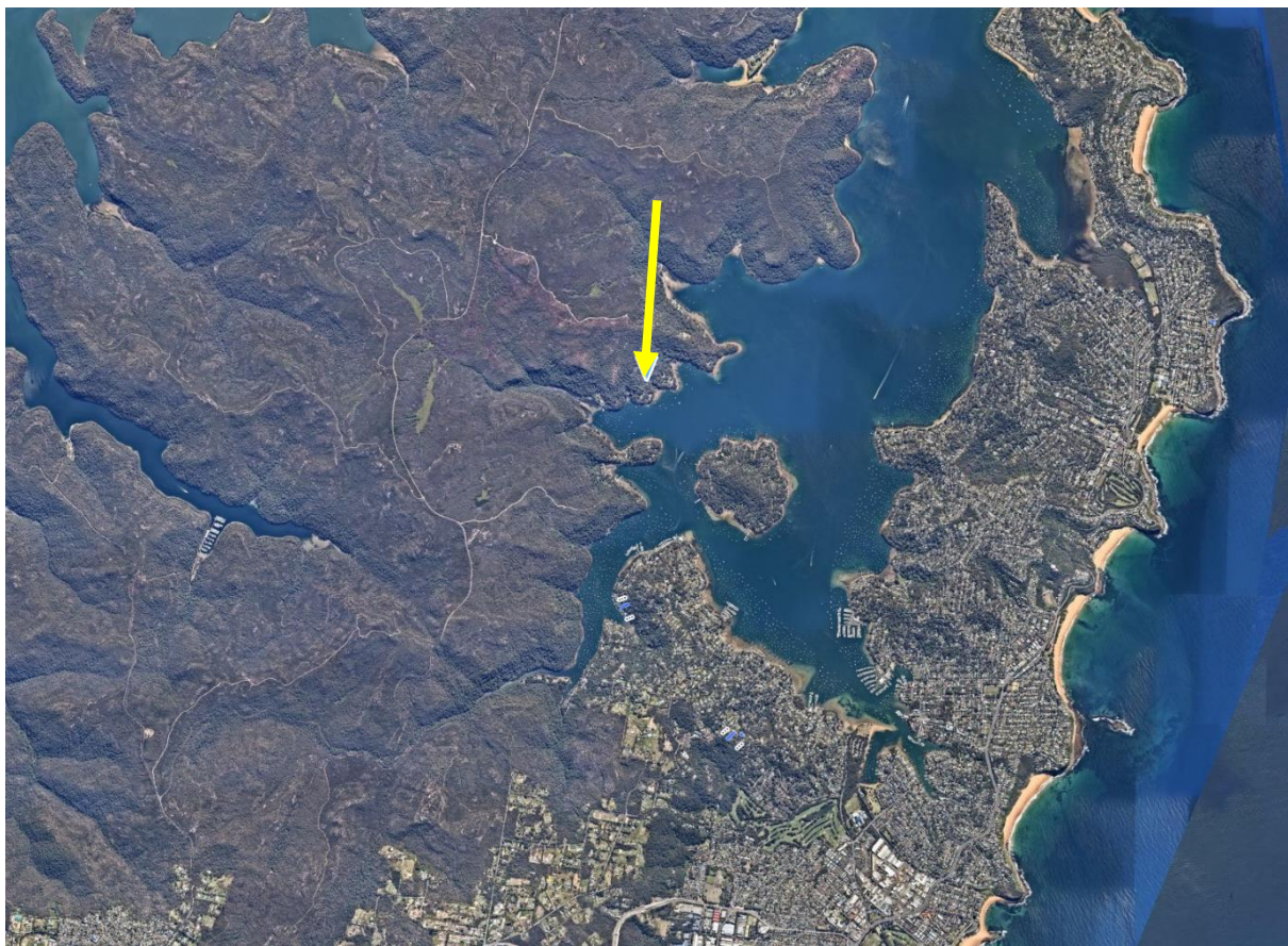
Photo 1 - An overview of the vegetation within the general area.

For the purpose of this assessment and compliance with Planning for Bushfire Protection this area of undeveloped land is considered to be Forest and is the hazard to this proposal.