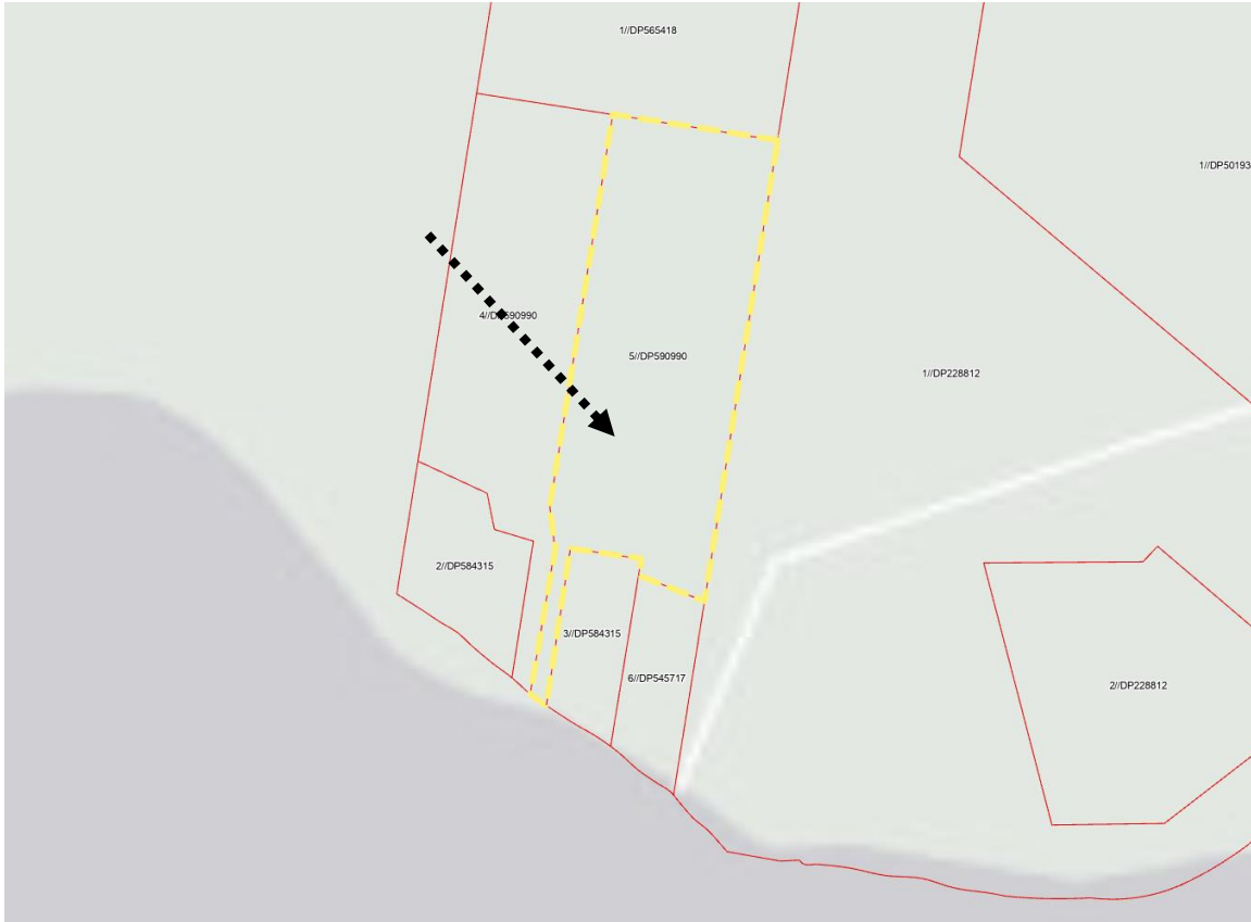
Map 1 shows the cadastral layout around the subject lot.