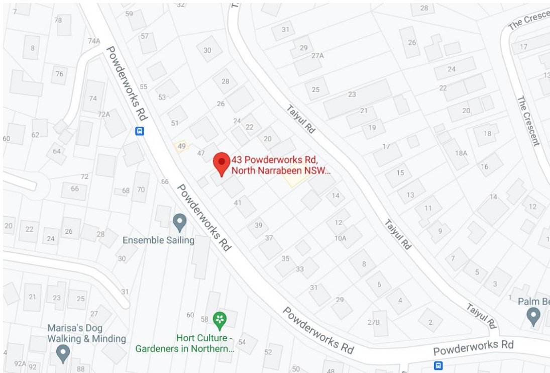
Fig 1: Location of subject site

The details of the site are included on the Survey Plan prepared by Rennie Golledge Pty Ltd, Reference No. 13.21, dated 5 February 2021, which accompanies the DA submission.