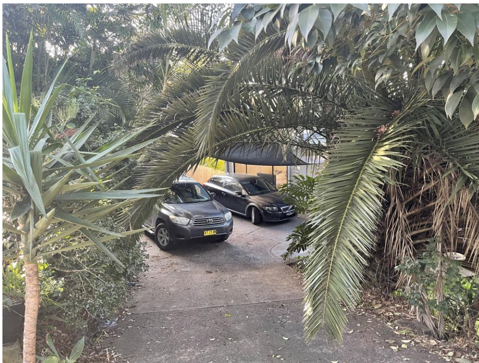
Fig 2: View of the subject site, looking north-east from Powderworks Road