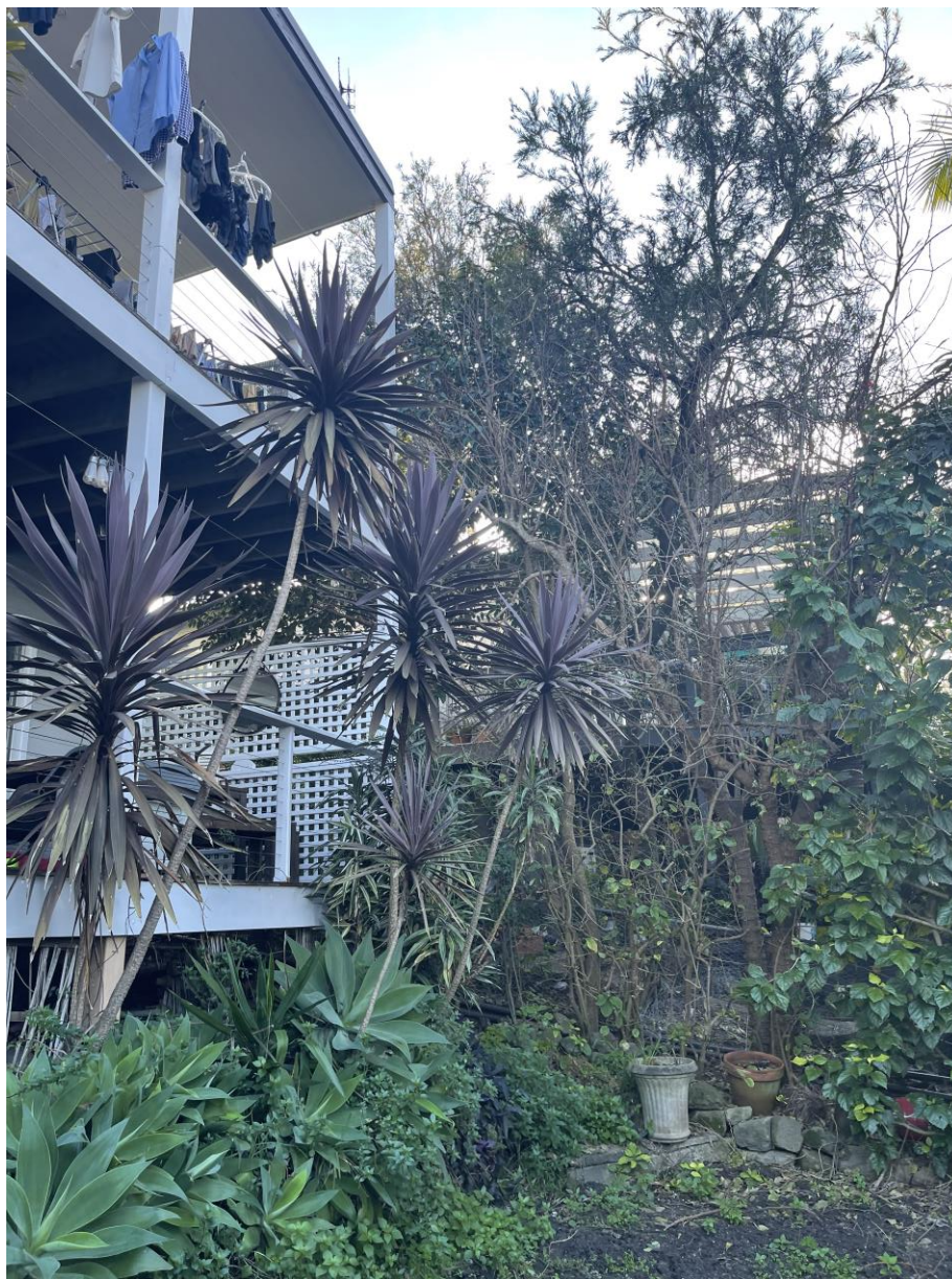
Fig 4: View of the northern, rear corner of the dwelling and the location of the proposed upper floor level living room extension, looking west