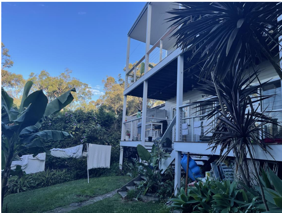
Fig 5: View of the rear yard and rear elevation of the dwelling, looking south-east