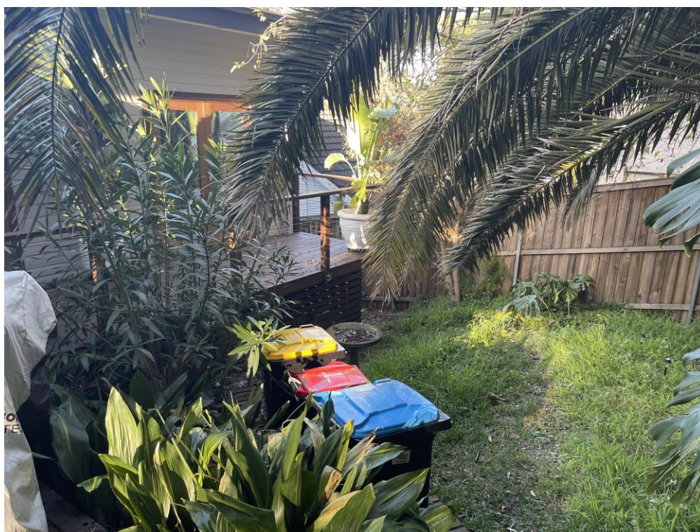
Fig 3: View of the front yard of the subject site and the location of the proposed low level retaining wall, looking east