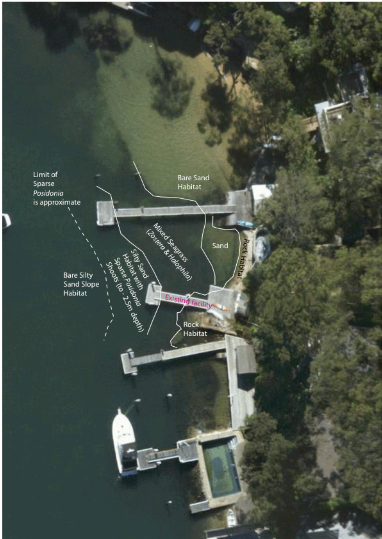
Figure 5 Main aquatic habitats at the subject site on 7 August 2013.