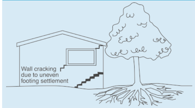
Trees can cause shrinkage and damage

As the weather pattern changes and the soil begins to dry out, the external footings will be first affected, beginning with the locations where the sun's effect is strongest. This has the effect of lowering the external footings. The doming is accentuated and cracking reduces or disappears where it occurred because of dishing, but other cracks open up. The roof lines may become convex.