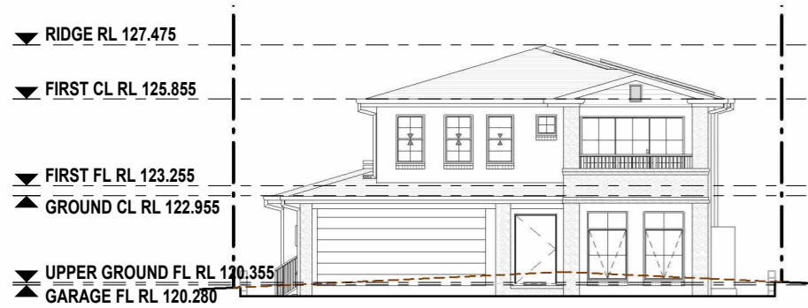
2 FRONT ELEVATION 06.07 1 : 200