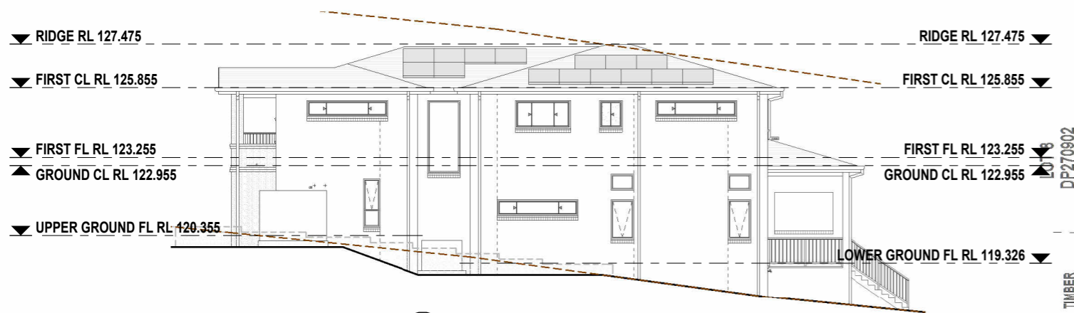
4 RIGHT ELEVATION 06.07 1 : 200