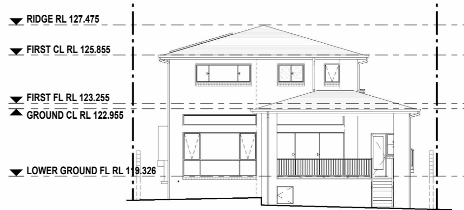
3 REAR ELEVATION 06.07 1 : 200