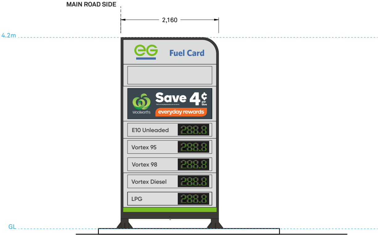
FRONT VIEW - New 4m Pylon SCALE 1:50