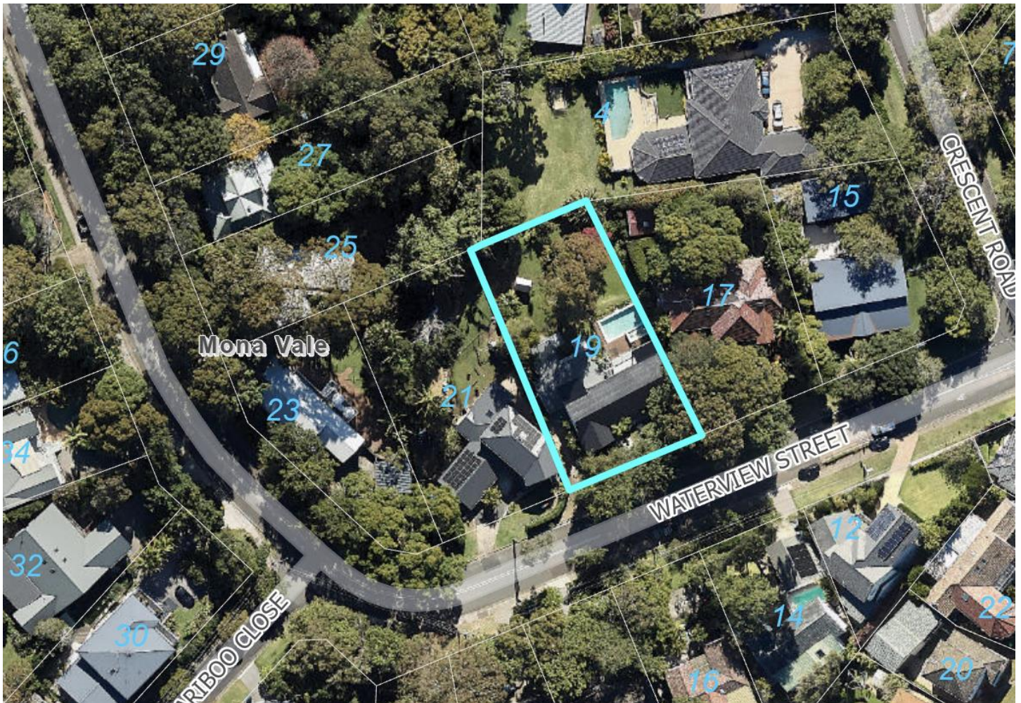
Figure 1: Location of site