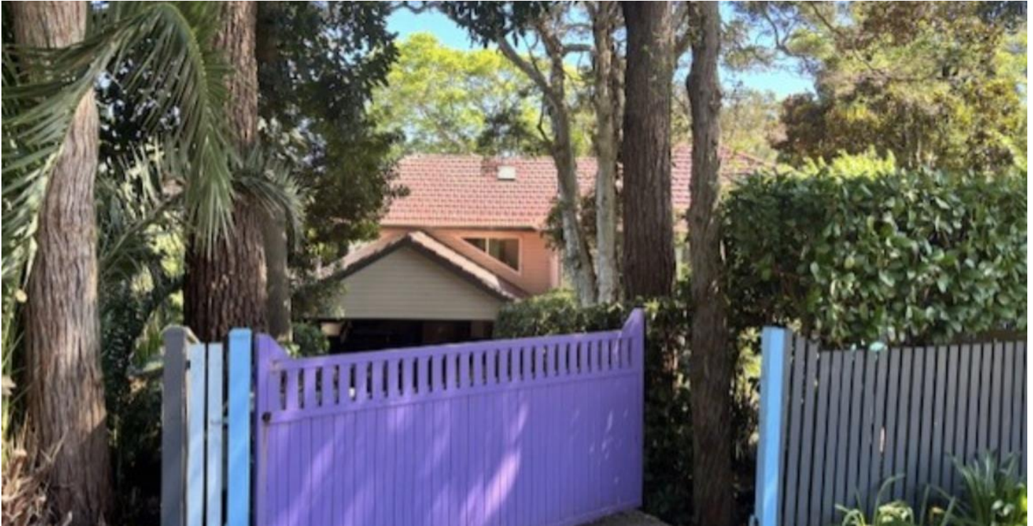
Figure 2 – No. 17 Waterview Street

dwelling proposed to be located to the rear (northwest corner) of the subject site. No. 21 is set at a higher gradient than the siting of the proposed single storey secondary dwelling.