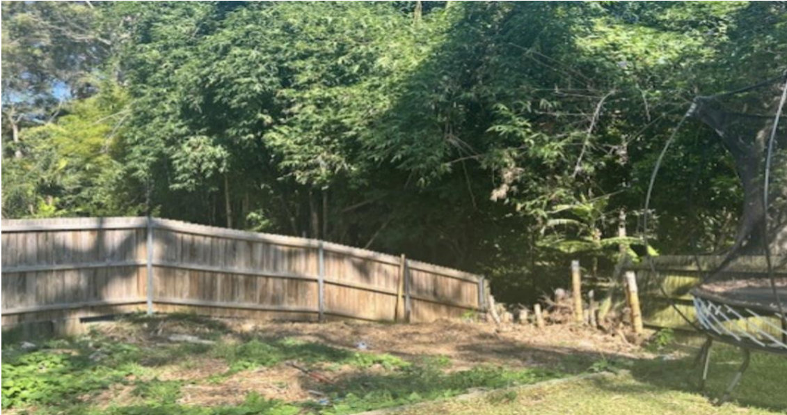
Figure 7: Site photo from site looking towards Heritage Item – the bamboo planting is the rear of the lot at 25 Waterview Street (Heritage Items 2270470)

Heritage Item. For the reasons provided, as Heritage Management Document or Heritage Impact Statement is not required.