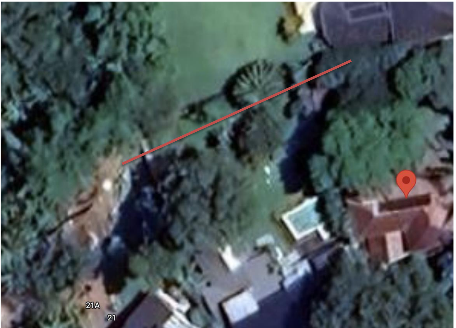
Figure 8: Aerial Google maps extract showing the rear setback of adjacent built form at no. 17 Waterview Street.