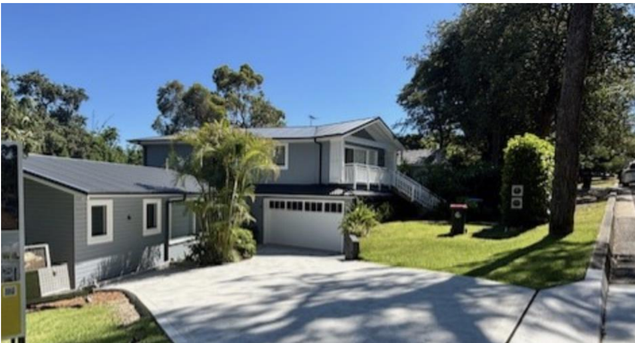
Figure 2 – No. 21 Waterview Street

Adjacent residential property includes no. 21 and 17 Waterview Street.