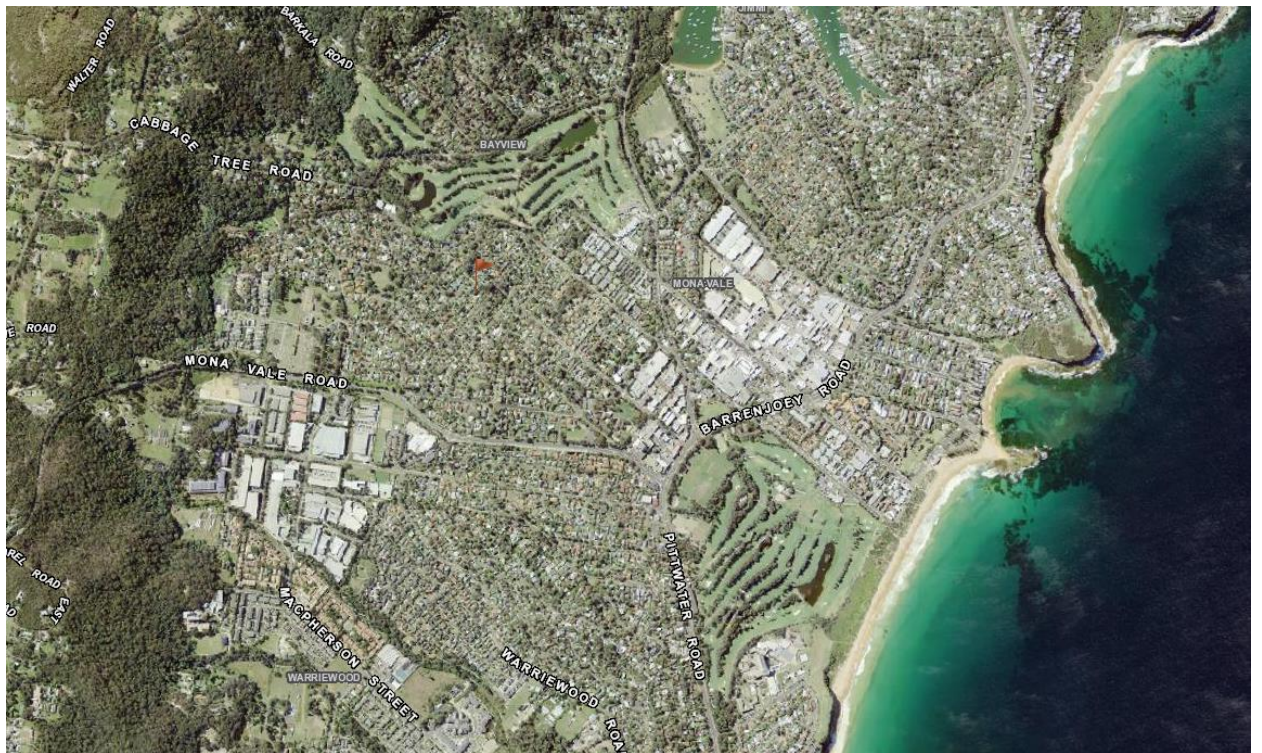
Figure 3. Aerial Image of the site within the locality