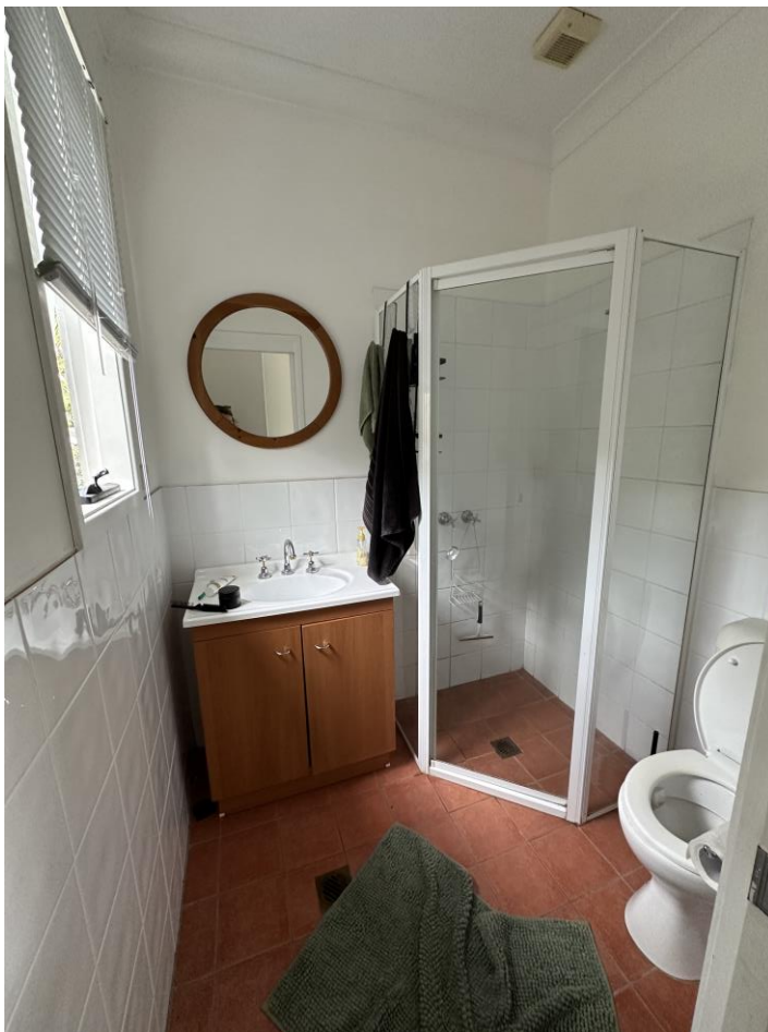
Figure 7. The existing bathroom