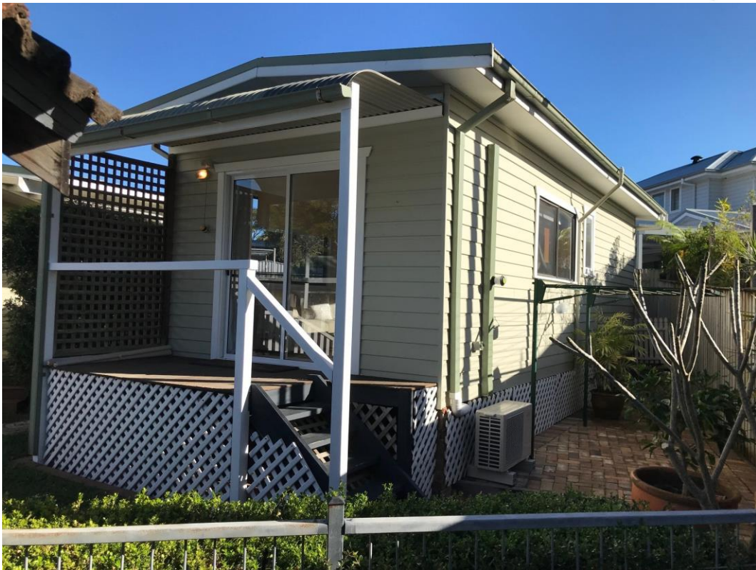
Figure 8. The front of the existing secondary dwelling