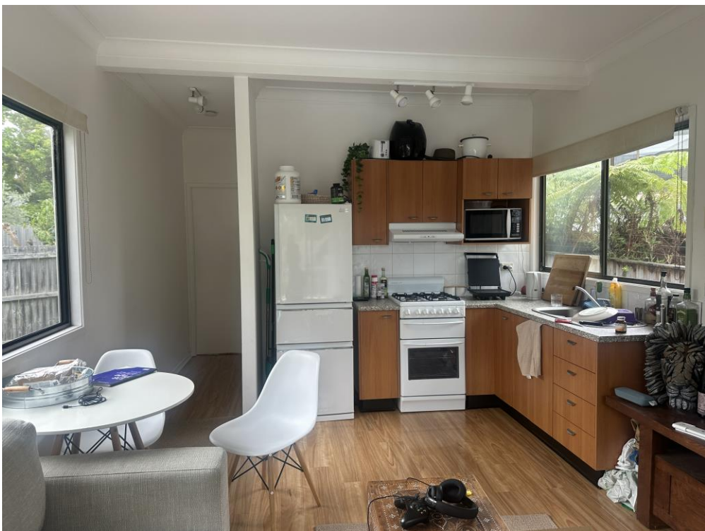
Figure 5. The existing kitchen in the secondary dwelling