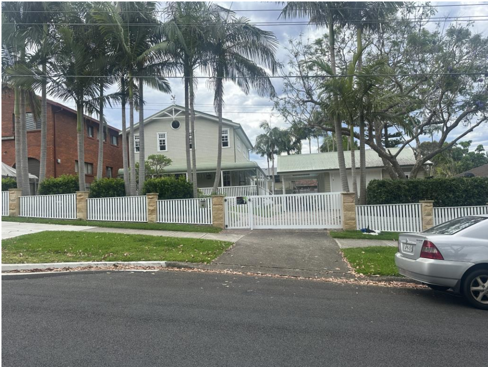
Figure 4. The front of the principal dwelling