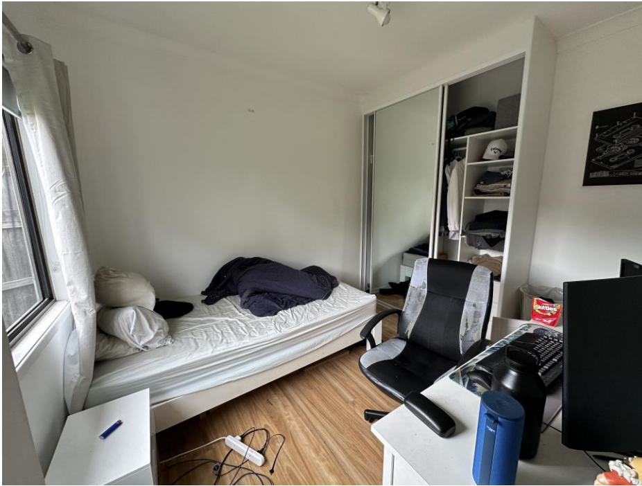
Figure 6. The existing bedroom