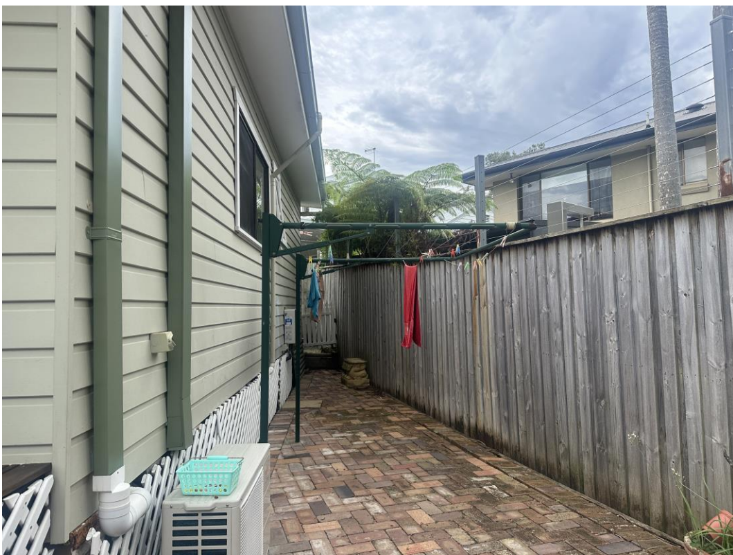
Figure 9. The rear of the existing secondary dwelling.