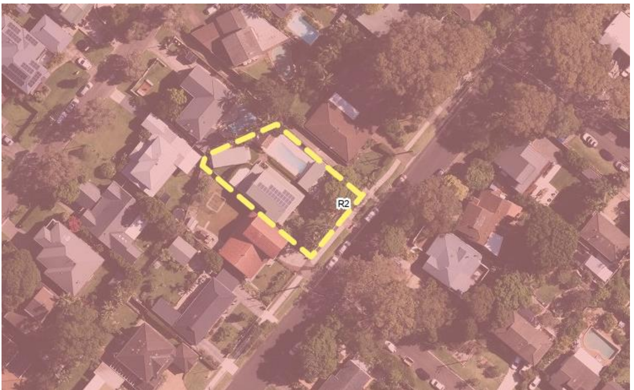
Figure 10. Extract from Pittwater LEP 2014 Zoning Map

The development is for the change of use to a secondary dwelling and secondary dwellings are permitted with consent in the R2 Low Density Residential zone.