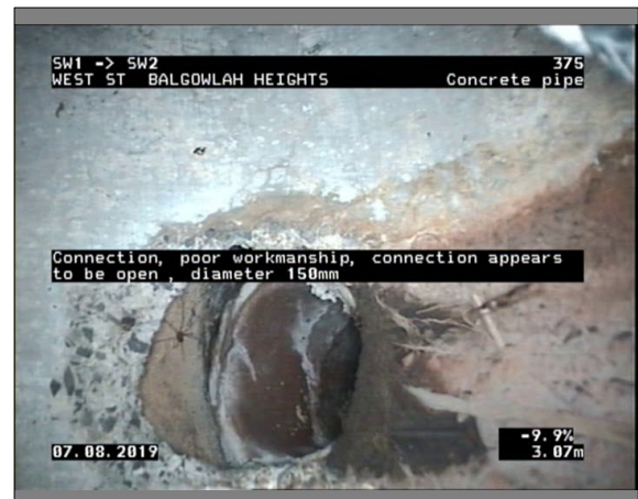
Photo: 1_1_8_A.JPG 3.07m, Connection, poor workmanship, connection appears to be open , diameter 150mm