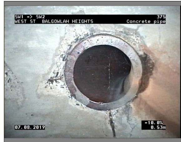
Photo: 1_1_5_A.JPG 0.53m, Connection, poor workmanship, connection appears to be open , diameter 150mm