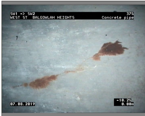
Photo: 1_1_4_A.JPG 0m, Circumferential fracture , width 0.5mm , from 1 to 5 o'clock