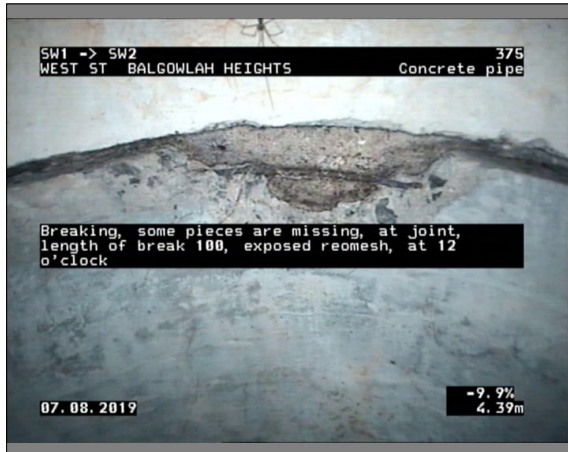
Photo: 1_1_9_A.JPG 4.39m, Breaking, some pieces are missing, at joint, length of break 100, exposed reomesh, at 12 o'clock