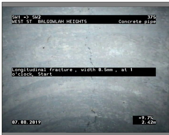
Photo: 1_1_6_A.JPG 2.42m, Longitudinal fracture , width 0.5mm , at 1 o'clock, Start