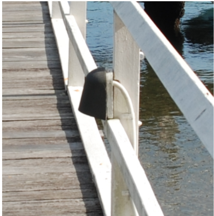
New light fittings fixed to new handrail (white painted timber)