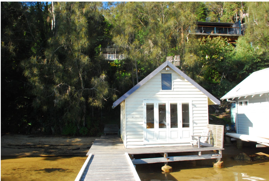
Existing boat shed to remain (above photo), but lifted in new positon. New coat of paint over external surfaces, colours to match existing. Decking around boat shed to be demolished and rebuilt like for like, but in new materials and at higher RLs.