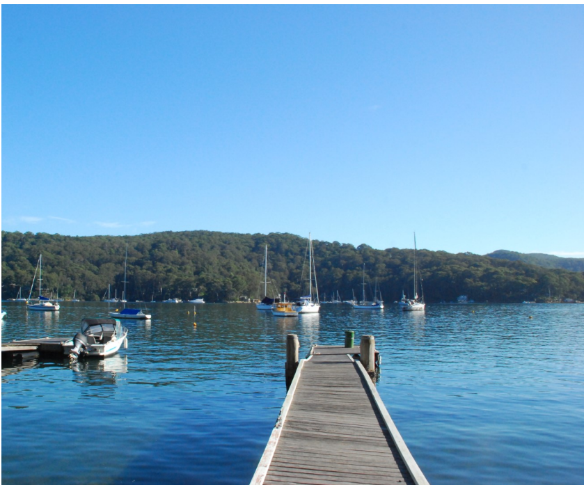
Existing jetty wharf (above photo) to be demolished and re-built like for like with new materials and at higher RL. Toe rails to be painted to match existing colour