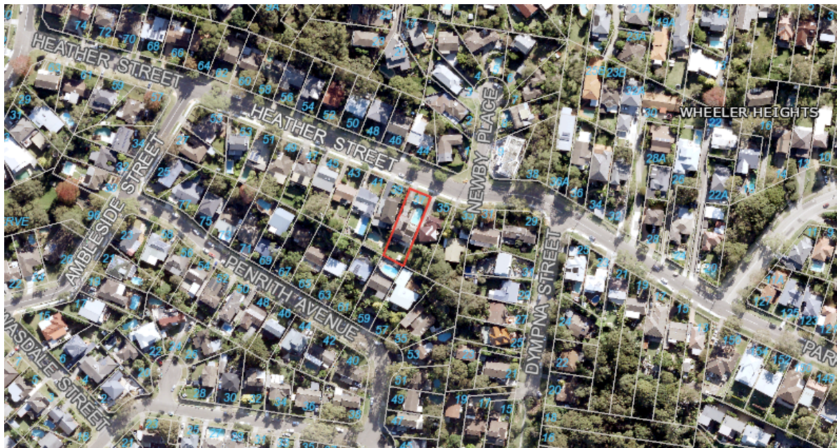
Image 2: Site location – 37 Heather Street, Wheeler Heights – Red Polygon