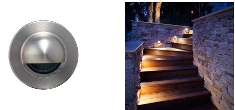
EURO STEP LITE SOLID EYELID

NOTES: ALL LIGHTS FROM HUNZA OUTDOOR PURE LIGHTING OR SIMILAR INSTALLED TO MANUFACTURER'S SPECIFICATION.