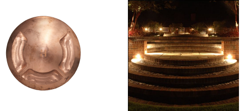
EURO PATH LITE