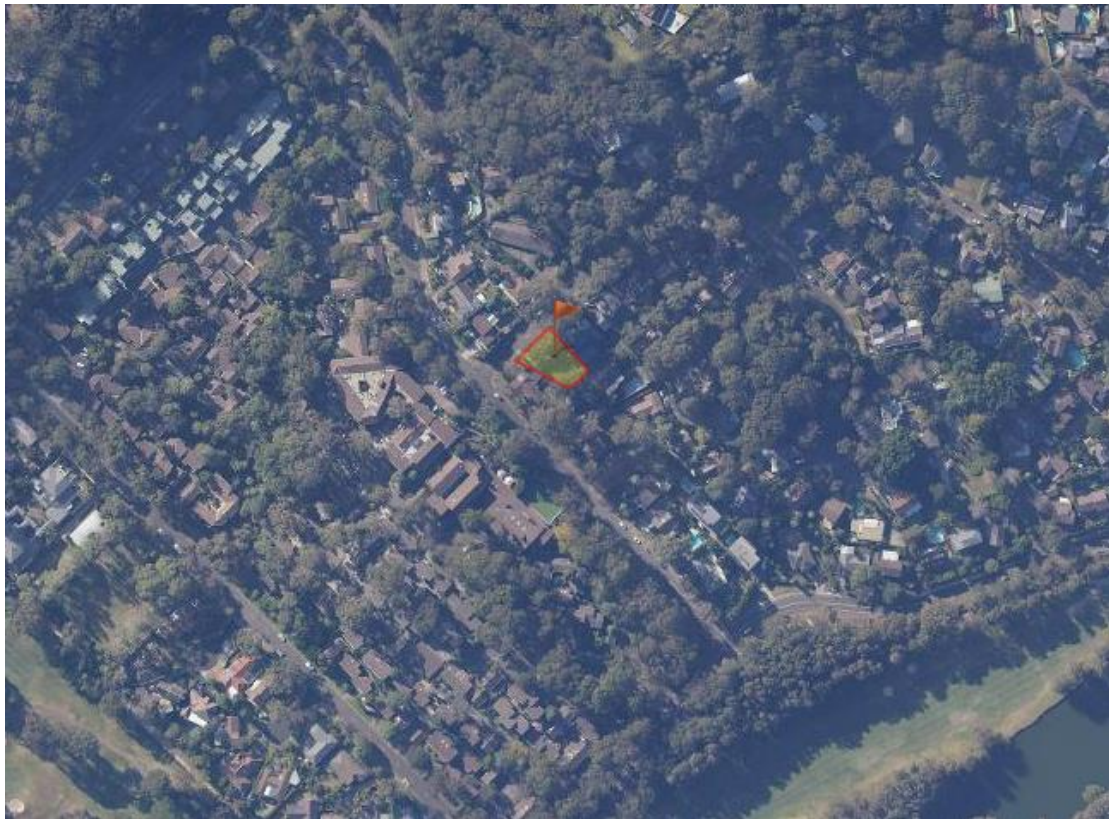
Aerial View Of 30 Utingu Place in relation to surrounding vegetation and Pittwater Waterway

The location of 30 Utingu Place, Bayview is on the southern side of Utingu Place approximately 400m north from Cahill Creek & approximately 1km from Pittwater Waterway.