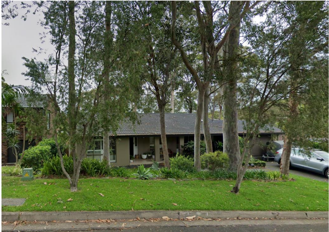
Street view perspective of the existing street access from Utingu Place