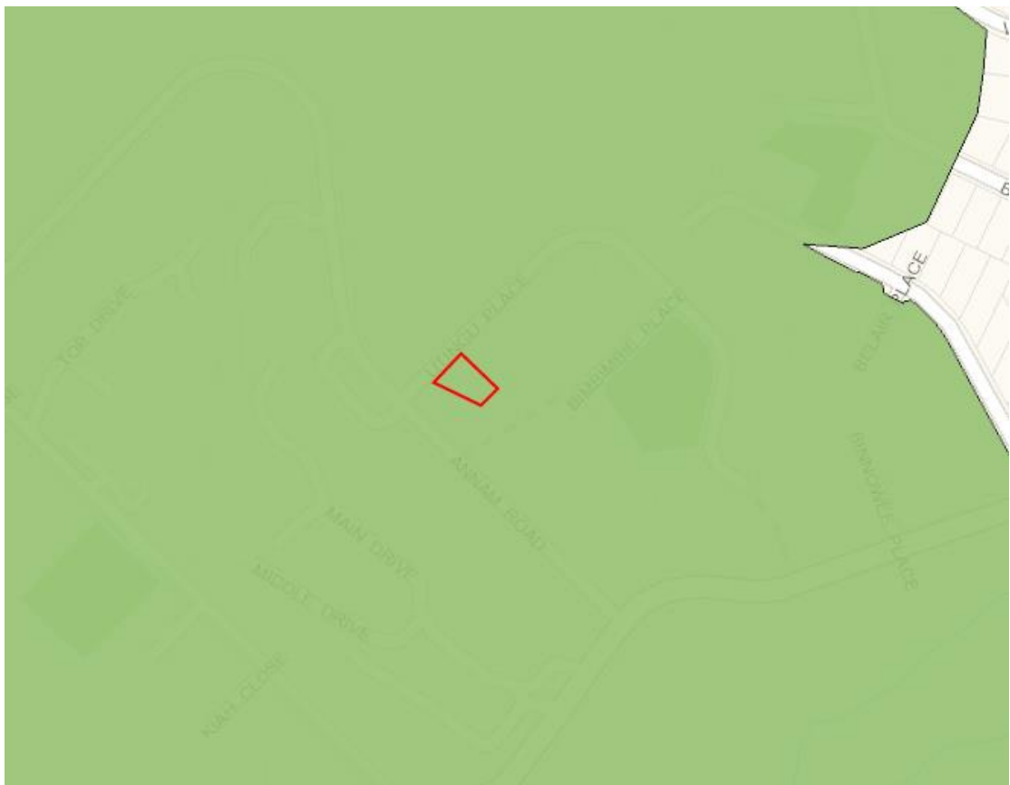
Biodiversity map under the Northern Beaches Council DCP mapping for the subject property