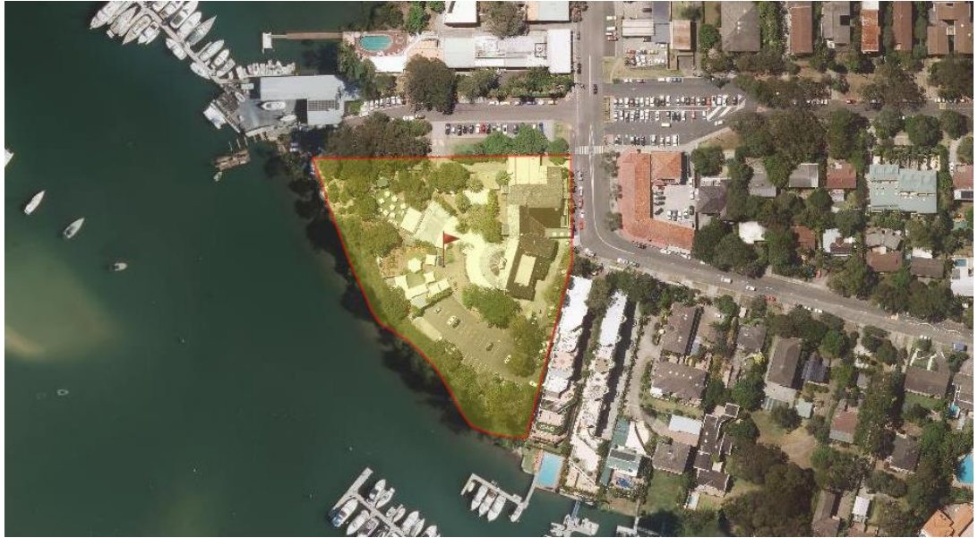
Figure 2: Aerial view of the subject site, outlined in red.