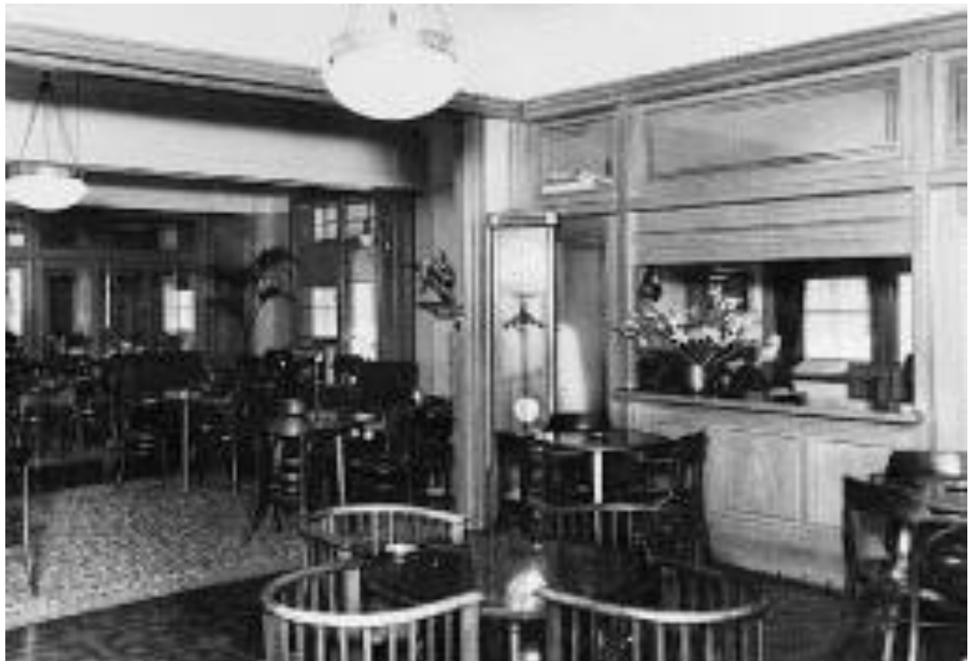
Figure 6: The interior of the Newport Arms Hotel in the 1930's.