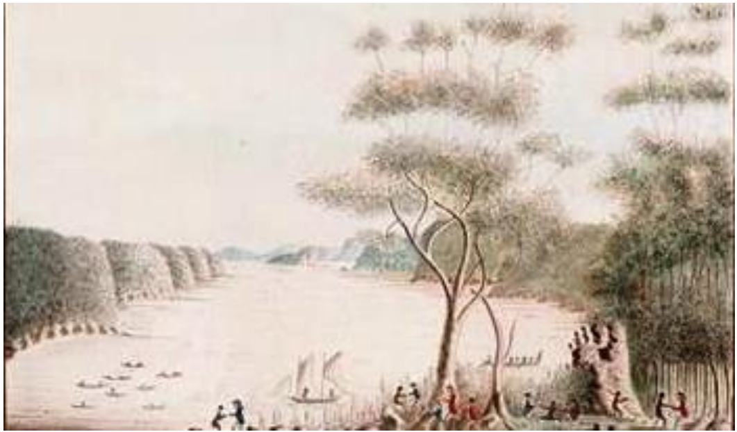
Figure 4: A view of Pittwater from 1788 with Lion Island in the distance