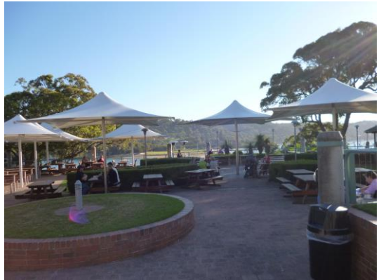
Figure 3: Clockwise from top left: The Newport Wharf to the north of the site which is identified as a maritime archaeological site, a tree lined residential street close to the subject site, a view of the western elevation from the external dining area, a view of the external dining area looking over Pittwater.