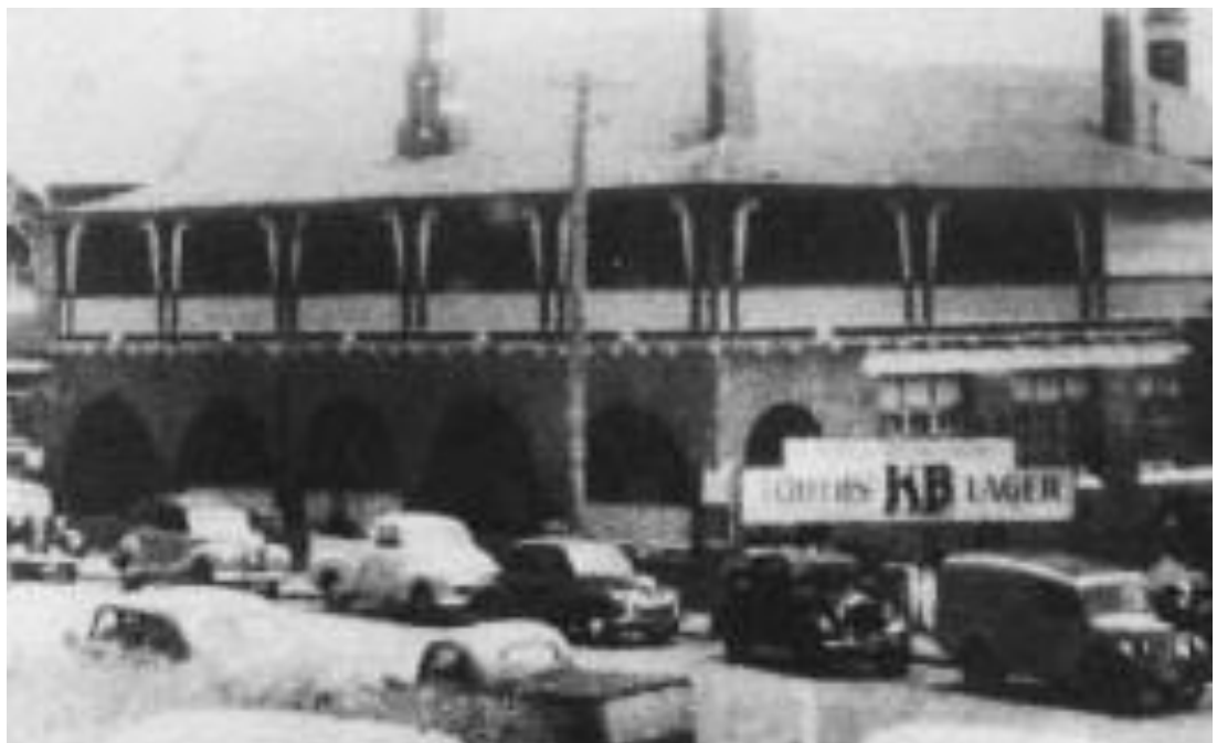
Figure 7: The Newport Arms Hotel in 1950.