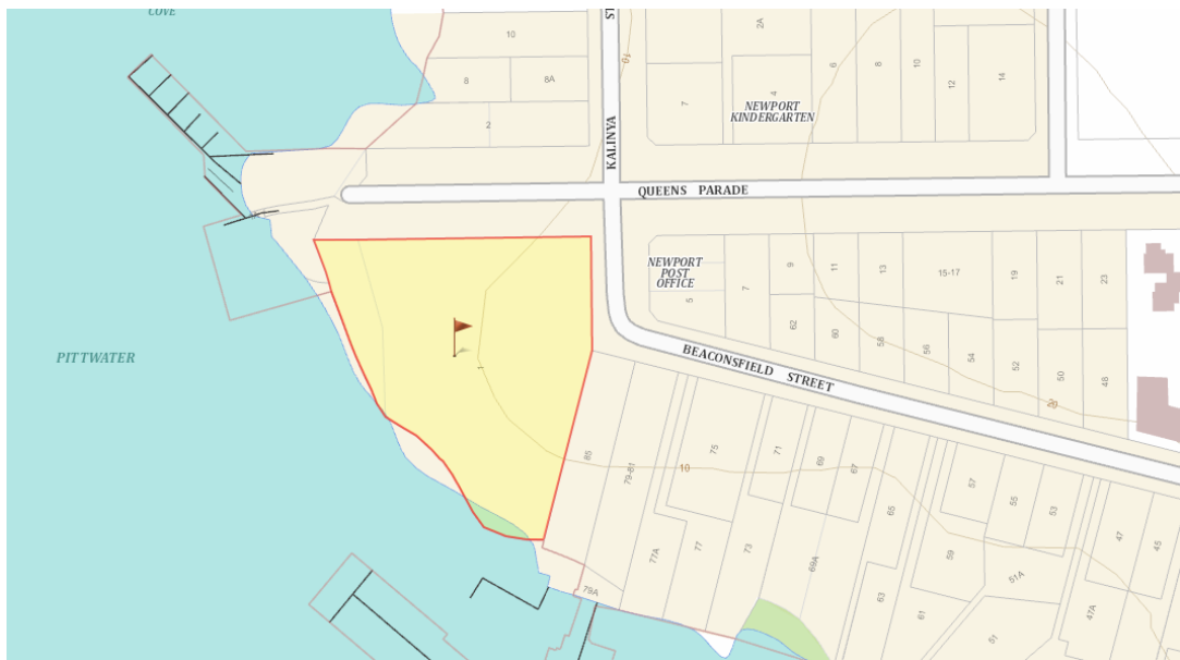
Figure 1: The location of the subject site, outlined in red.

The following includes photographs of the site and its context.