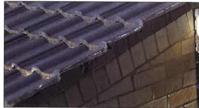
EXISTING ROOF TILES RETAINED