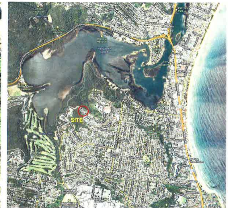
AERIAL VIEW OF NARRABEEN, NSW 2101 (NTS):