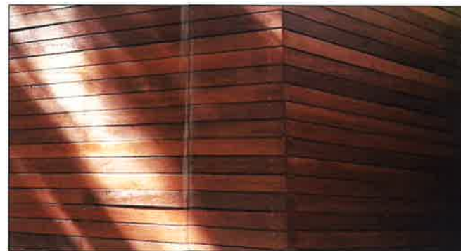
DECKING - BUSHFIRE TREATED MERBAU HARDWOOD