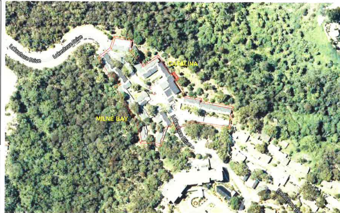
AERIAL VIEW OF CATALINA & MILNE BAY (NTS):