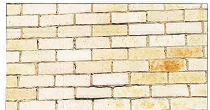
EXISTING BRICKWORK RETAINED