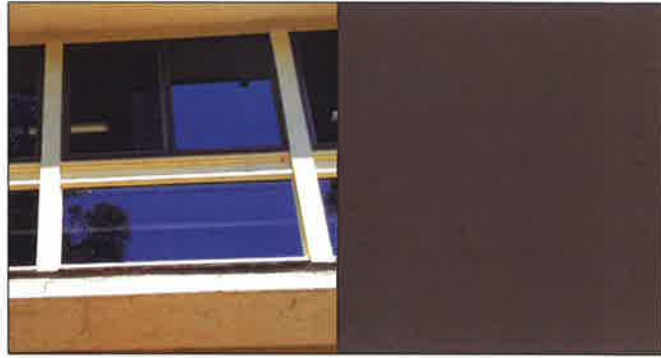
WINDOWS - HAMERSLEY BROWN TO MATCH EXISTING