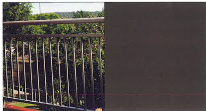
BALUSTRADE & STEEL COLUMNS - WOODLAND GREY