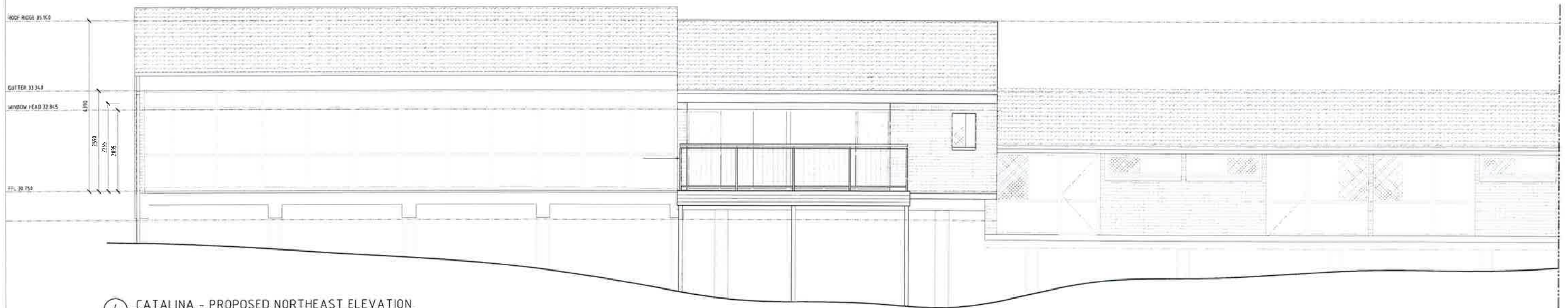
4 CATALINA - PROPOSED NORTHEAST ELEVATION SCALE 1:50 @ A1