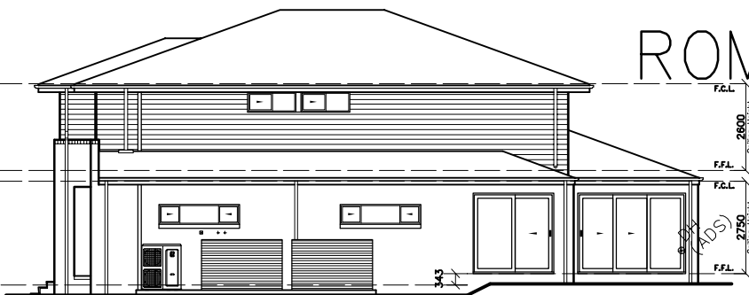
ELEVATION 2 -SOUTH-