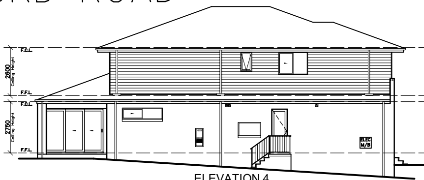
ELEVATION 4 -NORTH-