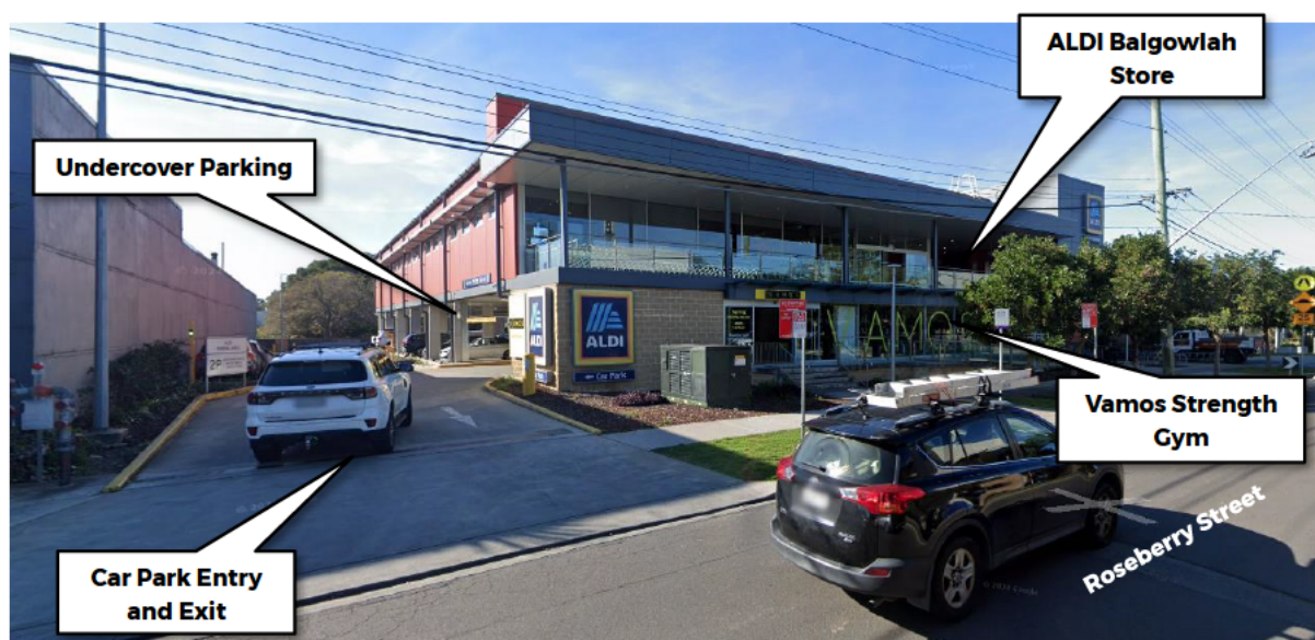
Figure 2: ALDI Car Park Location

This part of Roseberry Street is a two-way road that runs north-south and is bound by Kenneth Road to the north and Balgowlah Road to the south. Roseberry Street provides limited on-street parking on the eastern side of the road. Directly in front of the subject McDonald's site, on the western side of Roseberry Street, there is a no parking sign, indicating no parking at any time. Due to the limited on-street parking available on Roseberry Street, the ALDI site presents a desirable undercover parking area with no time restrictions for workers during the construction phase of the McDonald's development, should it be approved.